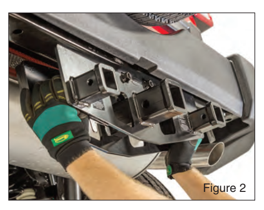
cross member, then install the 4 supplied bolts through the hitch and rear cross member and thread them into the weld nuts on the VersaHitch<sup>®</sup>