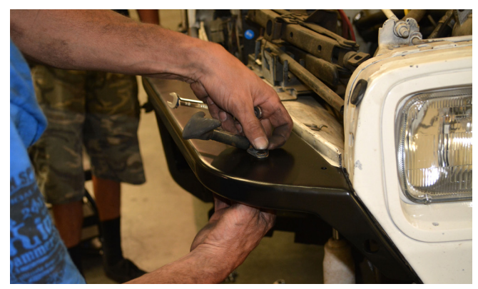
32. If you are using Poison Spyder DeFender Inner Fenders, install them using the instructions that came with them.

NOTE: It is recommended to relocate turn signals in accordance with your local laws. If you wish to convert to high intensity 3/4" round LED turn signals, the DeFenders™ have a small hole located near the front where it meets the grille, especially for this use. Note that this lamp requires some wiring skill to install and may also require a special "flasher" module (also available through Poison Spyder).