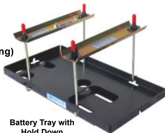
Battery Tray with Hold Down Part No. 34-965-1TK

CAUTION: Always wear protective eye gear when working with highly explosive batteries.