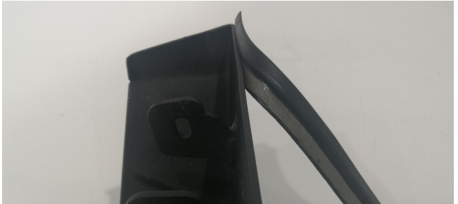
Fig. 6 Fig. 7

6. Stick weatherstrip (item. 5) on face side of fender, on the edge of fender, as shown in fig. 6-7.