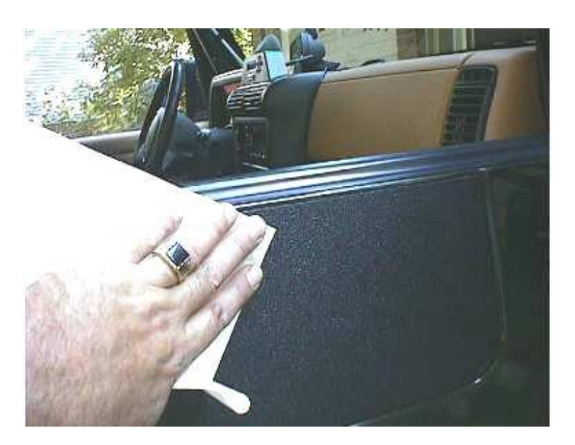
Rub <u>from the center of the Protector out toward the edges</u>. This will help eliminate air pockets.

When you are satisfied with the alignment and installation, use a clean dry paper towel or the Door Protector Backing Paper and <u>thoroughly rub down the entire Protector</u> to finish adhesion.