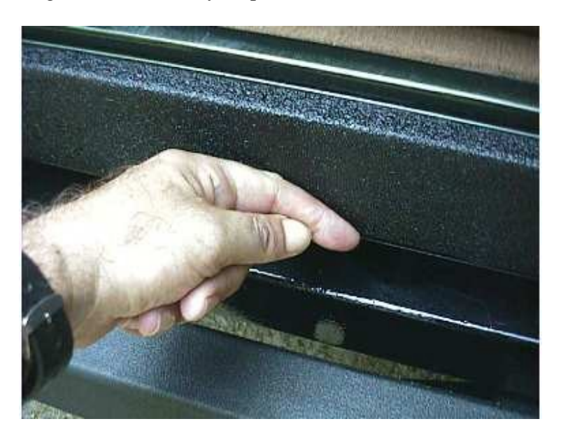
Finally using the Tailgate Sill Protector Backing Paper or a clean paper towel <u>thoroughly</u> <u>rub down the enter Protector</u> for finish adhesion.

Then press the vertical surface of the protector down against the Sill using the backside of your finger to work out any air pockets.