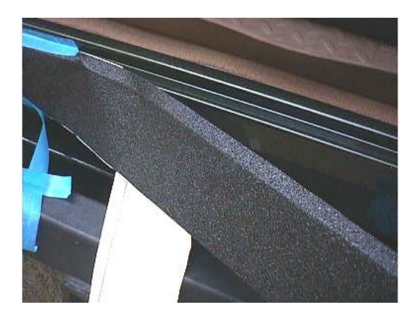
Carefully seat the Sill Protector to the Sill at the Bend.

<u>Carefully remove the masking tape and backing paper from the right side of the <u>Protector</u>. Be sure to leave the left side taped in place. ( This kept the Protector properly located where I wanted it. )</u>