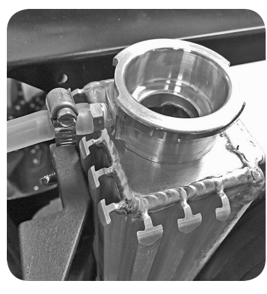
Tubing attached to Radiator

Place provided cap (without pressure valve) on overflow tank and road test.