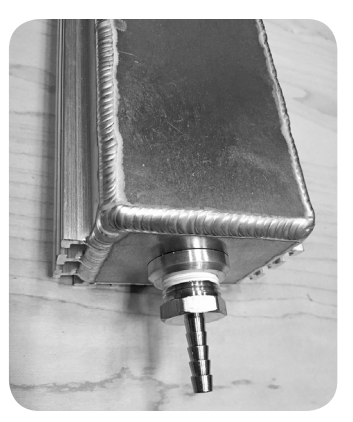
Larger bottom fitting, shown installed