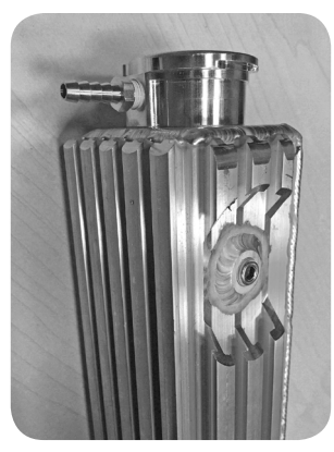
Small fitting and plug, shown installed