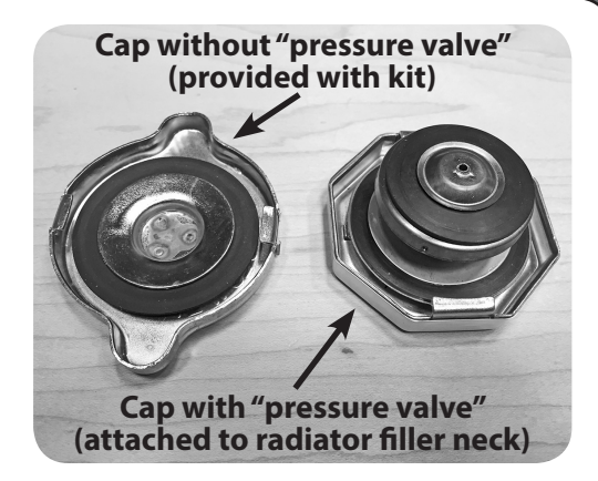
Radiator Cap "differences"