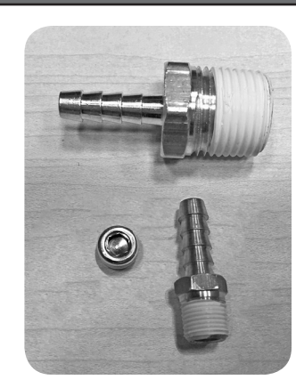
Fittings to be used, shown with Teflon tape

Locate the ¼" barbed hose fitting with ½" NPT threads and screw-in / secure into the large welded on port at bottom of the tank. Use Teflon tape to seal all threads.