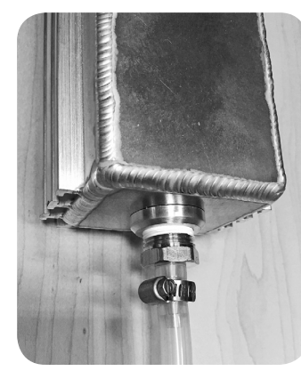
Tubing attached to bottom of Overflow tank