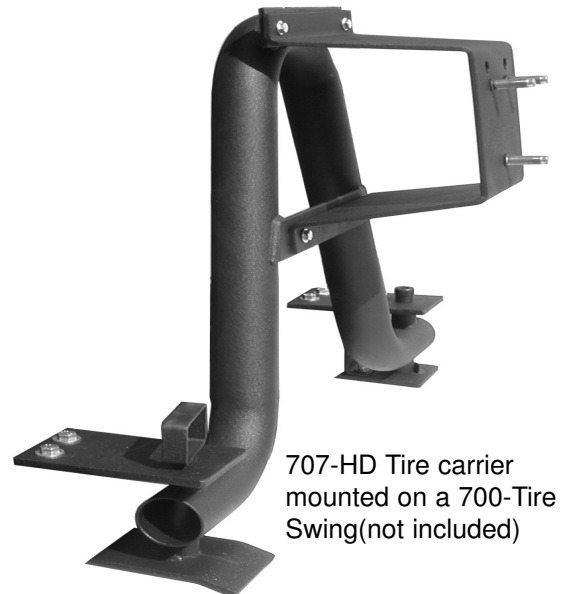
707-HD Tire carrier mounted on a 700-Tire Swing(not included)