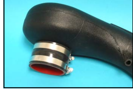
Install the S&B cold air tube thru the S&B cold air box and onto the throttle body