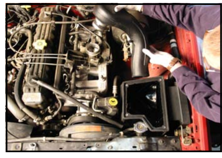
Loosen the 3 nuts that hold the stock air. box to the fender well of the vehicle.