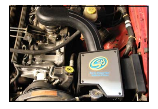
Bolt the S&B cold air box to the fender wall. "Place the stock air box grommets underneath the air box". Use the stock