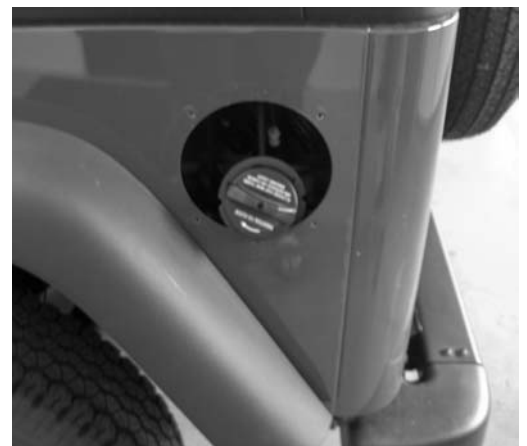
Figure #1 – Remove Gas Tank Outer Flange