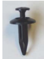
Tuf-Lok Fastener (6 per)