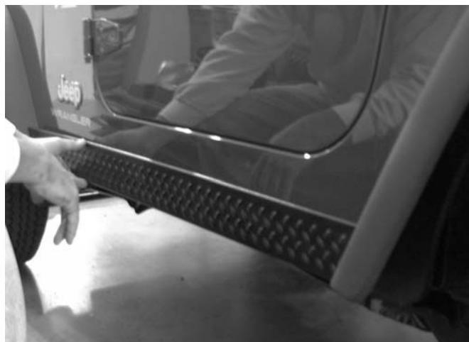
Figure #7 – Install Side Panel