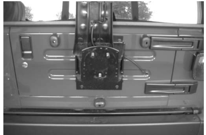
Figure #3 – Remove Spare Tire