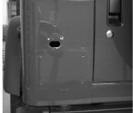
Figure #2 – Remove Tail Light & License Plate