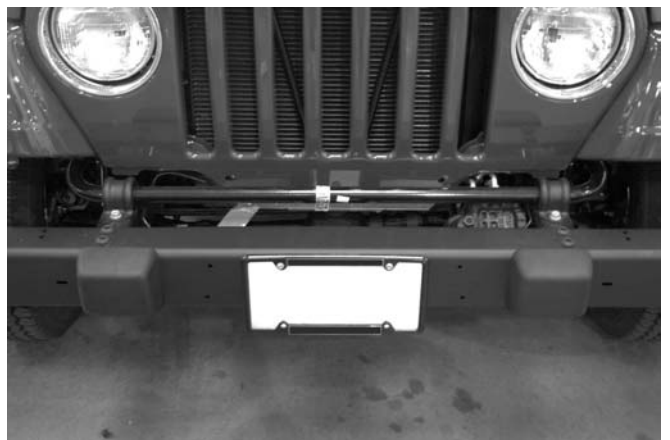
Figure #8 – Factory Front Panel Removed