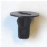
Square Plastic Grommet (4 per)