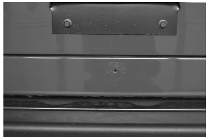
Figure #4 – Remove Tire Stop