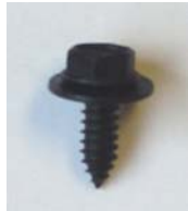
10mm Hex Screw (4 per)