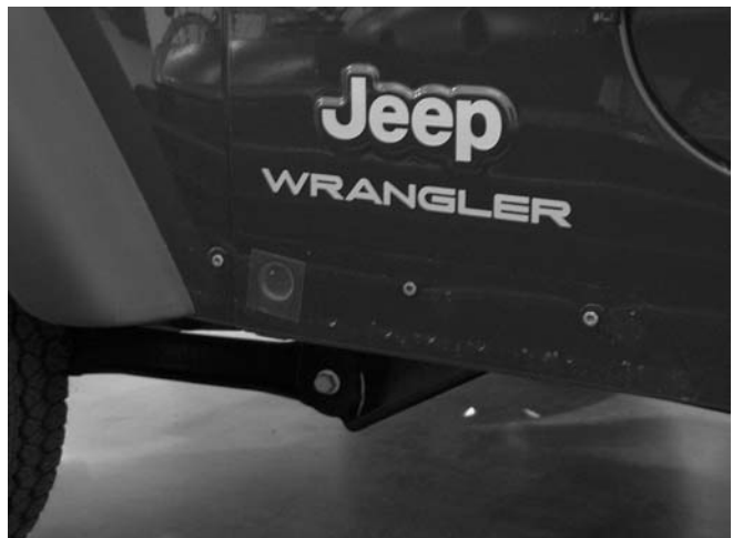
Figure #6 – Remove Stone Guard