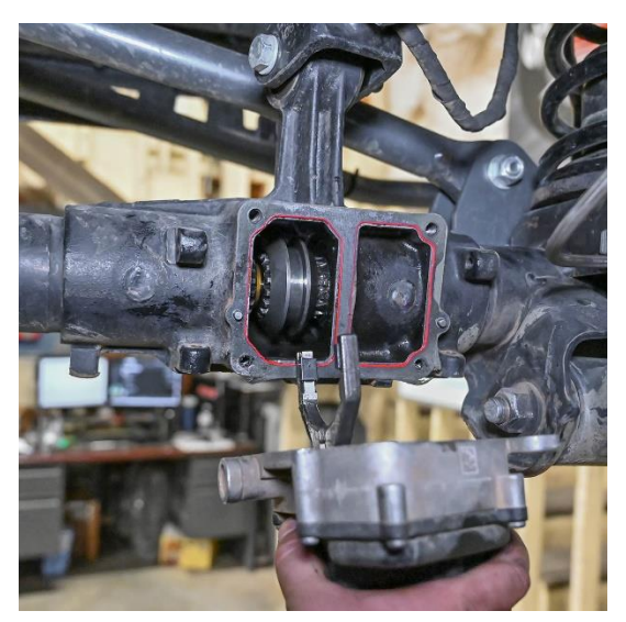
Figure 23. Front Axle Disconnect Motor Reinstallation