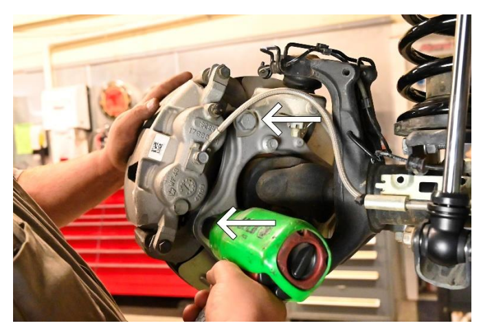
Figure 1. Brake Caliper Carrier Bolts

4. Remove the brake rotor retaining bolt (T30 Torx). See Figure 2 .