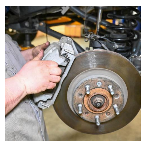
Figure 24. Brake Caliper Installation

32. Synergy ball joints come pre-greased. If you are going to grease them after installation use no more than one 'pump' of grease from a grease gun. We recommend Synergy Lithium Complex Extreme