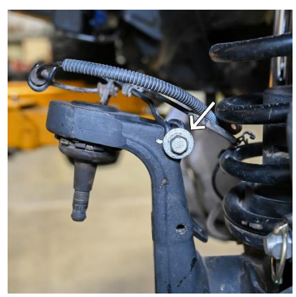
Figure 9. ABS Cable Tab Bolt

13. Remove the dust boots from all the ball joints and wipe up all old grease. First, press out the upper ball joint 'down' out of the housing, then press the lower ball joint 'down' out of the housing. See Figures 10 and 11.