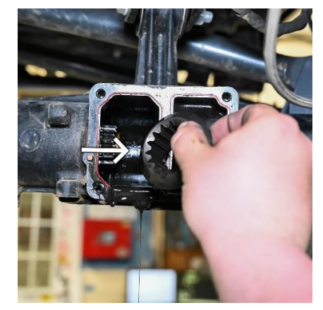
Figure 6. Front Axle Disconnect Collar

9. Remove the wheel bearing bolts from the back side of the steering knuckle (12-point 13mm). See Figure 7 .