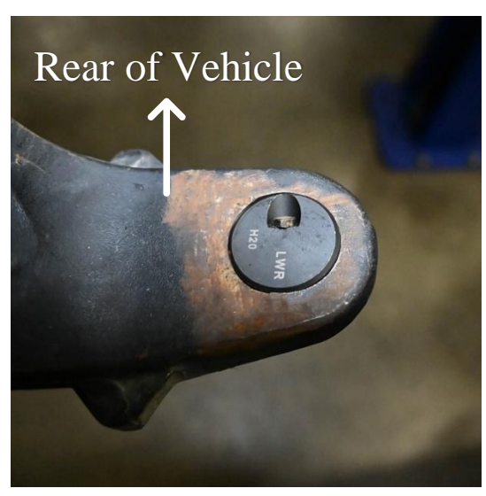
Figure 16. Lower Ball Joint Zerk Orientation

recommend orienting the zerk fitting so that it is pointing towards the rear of the vehicle, slightly toward center. See Figure 16.