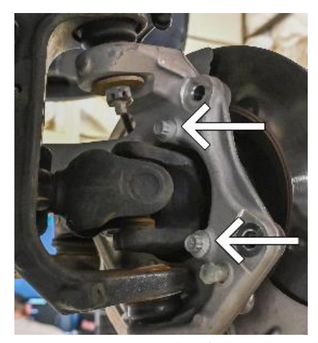
Figure 7. Wheel Bearing/Hub Bolts (x3)