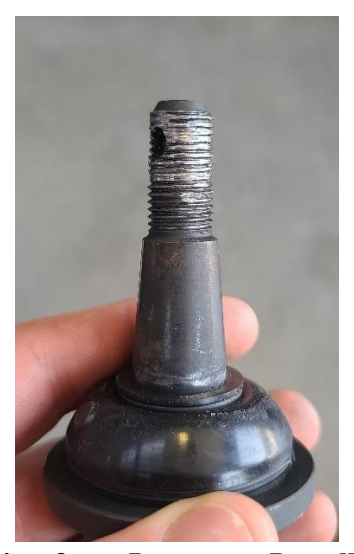
Figure 20. Damage Resulting from Improper Installation of Tapered Bushing