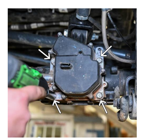
Figure 5. Front Axle Disconnect Motor