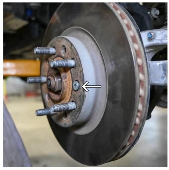
Figure 2. Brake Rotor Retaining Bolt

4. Remove the brake rotor retaining bolt (T30 Torx). See Figure 2 .