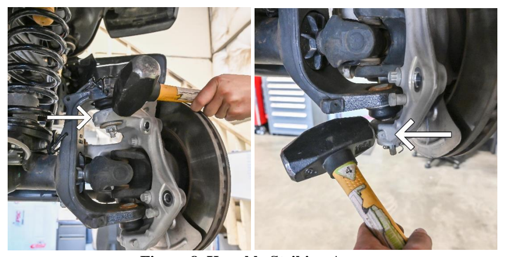
Figure 8. Knuckle Striking Area

12. Remove the 13mm bolt that secures the ABS sensor cable. See Figure 9 . Hang the cable with the brake caliper, away from the work area.