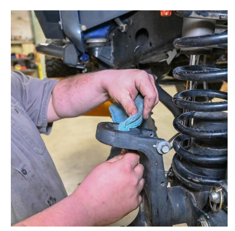
Figure 12. Cleaning Inner 'C' Bores

15. Identify the upper and lower ball joints. The parts are very similar and it is critical to install them correctly. The upper ball joints are marked "UPR" and have a longer threaded portion (just over 1"), the lower ball joints are marked "LWR" and feature a shorter threaded portion (just over .75"). See Figures 13,14, and 15.