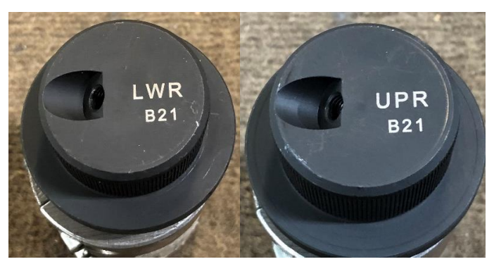
Figures 13 and 14, Labeled Ball Joints

15. Identify the upper and lower ball joints. The parts are very similar and it is critical to install them correctly. The upper ball joints are marked "UPR" and have a longer threaded portion (just over 1"), the lower ball joints are marked "LWR" and feature a shorter threaded portion (just over .75"). See Figures 13,14, and 15.