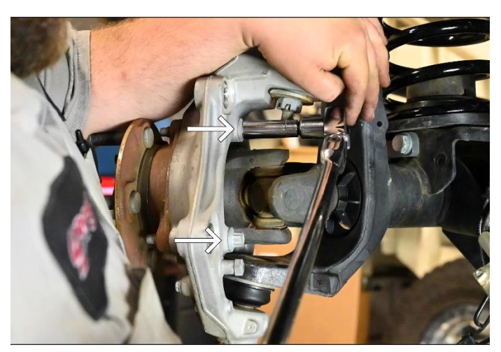
Figure 22. Unit Bearing/Hub Bolt Install

27. Re-install the unit bearing/hub/axle shaft assembly. Be careful when installing the axle shafts to not damage the inner axle seals and ensure the splines line up in the differential. We recommend cleaning all the hub bolts with brake cleaner and a wire brush, and then using high strength threadlocker on installation. Carefully thread the ABS sensors through the brake backing plates. Torque unit bearing/hub bolts to 75 lb-ft. See Figure 22.