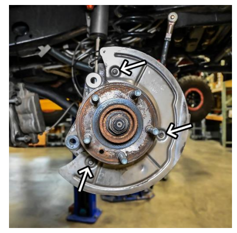
Figure 4. Brake Backing Plate Fasteners