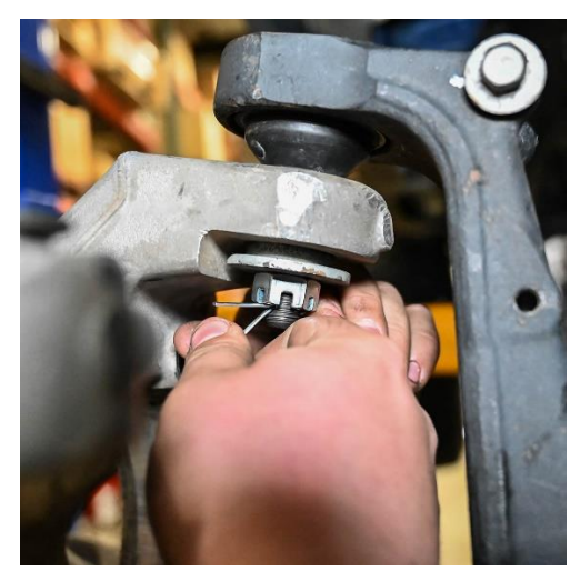
Figure 21. Properly Aligned and Installed Cotter Pins

27. Re-install the unit bearing/hub/axle shaft assembly. Be careful when installing the axle shafts to not damage the inner axle seals and ensure the splines line up in the differential. We recommend cleaning all the hub bolts with brake cleaner and a wire brush, and then using high strength threadlocker on installation. Carefully thread the ABS sensors through the brake backing plates. Torque unit bearing/hub bolts to 75 lb-ft. See Figure 22.