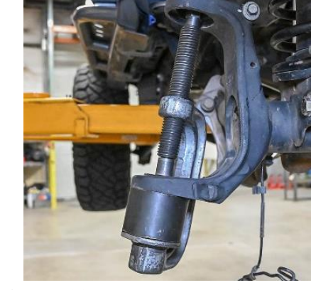
Figure 10. Upper Ball Joint Removal