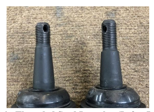
Figure 15, Difference in Threaded Stud Lengths. (Left – Lower, Right – Upper)

16. Orient the Synergy lower ball joints - Depending on the wheel offset, axle trusses and gussets, axle shaft size and other factors, the orientation of the zerk will need to be decided by the installer. We