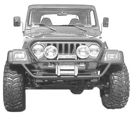
172-Front bumper with optional 162-stinger