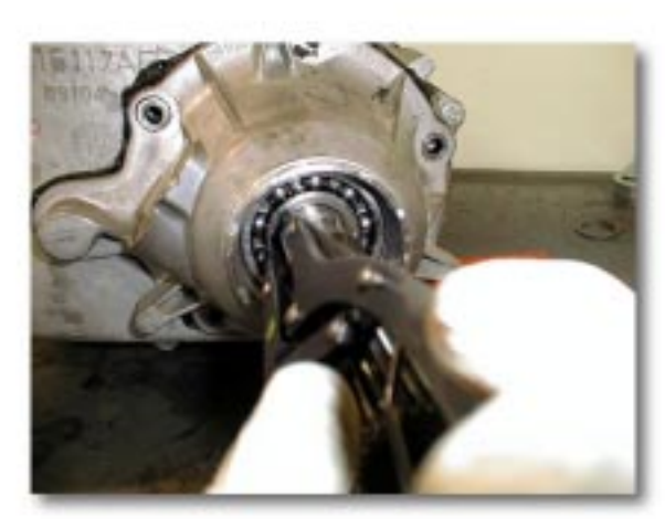
(Fig. 7) Rear I.D. Snap Ring Removal

(9) Remove rear bearing retaining rings. (Fig. 6) & (Fig. 7)