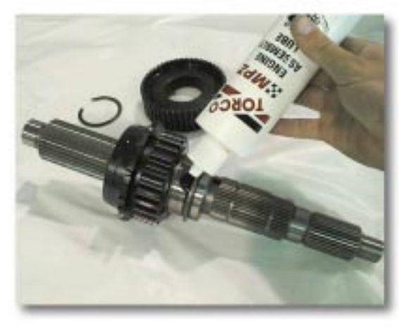
(Fig. 3A) New Main Output Shaft Assembly