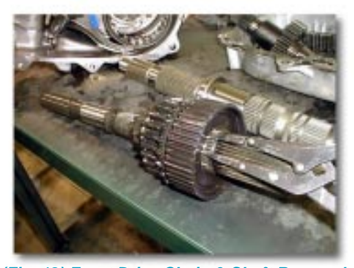
(Fig. 12) Front Drive Chain & Shaft Removal