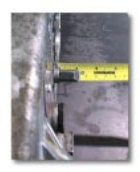
NOTE: On some NP231 transfer cases, the shift rail must be shortened. This shift rail protrudes out of the transfer case and goes into the tailhousing. The new tailhousing has a pocket depth of 1.125".

Shift your transfer case into 4WD so the shift rod is protruding the furthest out of the transfer case. If this shifter rod protrudes more than 1" out of the back side of the transfer case, then the shift rail must be shortened. Ideally the shift rod should protrude exactly 1".