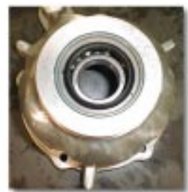
(Fig. 11A) Seal Installed