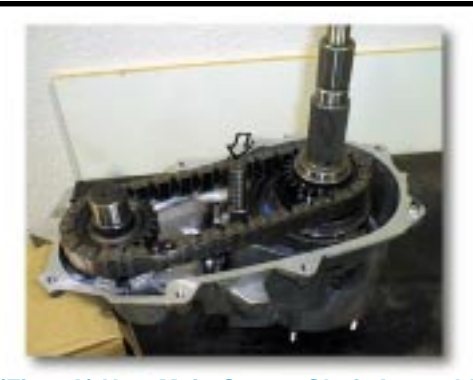
(Fig. 5A) New Main Output Shaft Assembly