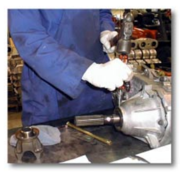
(Fig. 5) Rear Seal Removal

(8) Remove rear seal. Collapse with punch if needed. (Fig. 5)