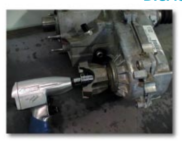
(Fig. 1) Yoke Nut Removal