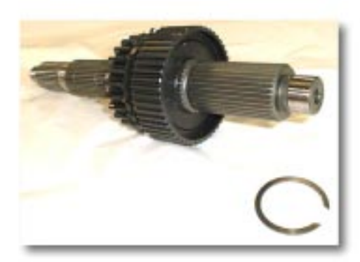
(Fig. 4A) (Large) Retaining Ring Installation CONTINUE TO PAGE 9