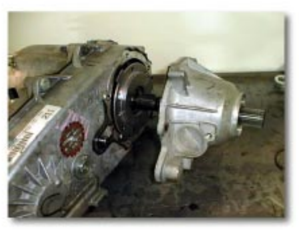
(Fig. 8) Rear Tailhousing Removal

(10) Remove tailhousing bolts with 10mm socket & remove tailhousing. (Fig. 8)