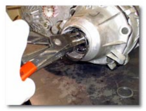
(Fig. 6) Rear O.D. Snap Ring Removal

(8) Remove rear seal. Collapse with punch if needed. (Fig. 5)