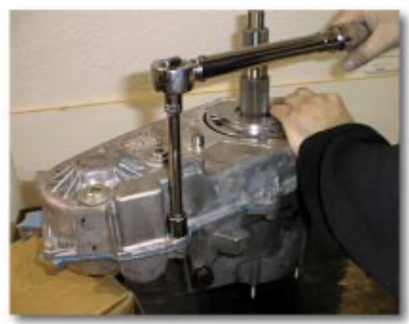
(Fig. 8A) Case Halves Assembled