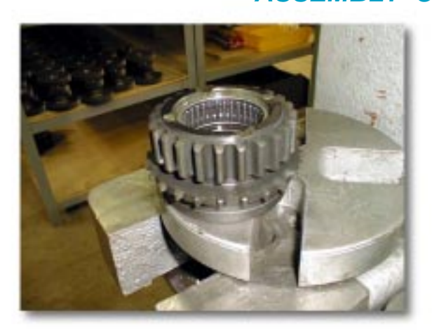
(Fig. 1A) Drive Sprocket Needle Bearings

(1) These bearings must be removed. Once the bearings are removed, clean the inside of the drive gear to make sure it is free of any type of debris.