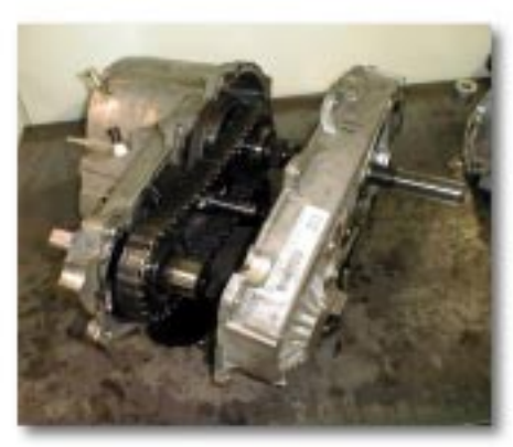
(Fig. 9) Rear Case Half Removal