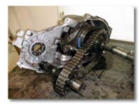
(Fig. 11) Front Drive Chain & Shaft Removal