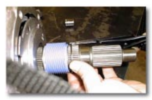
(Fig. 9A) Speed-o- Ring Gear Install