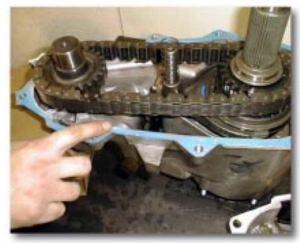
(Fig. 7A) Thin film RTV Applied Prior to Mating Case Halves.