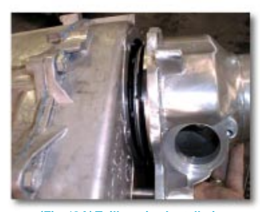
(Fig. 12A) Tailhousing Installation