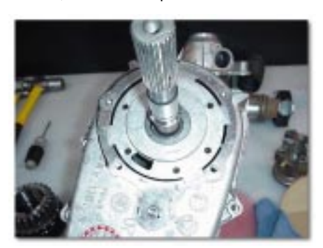
(Fig. 10) Oil Pump Removal