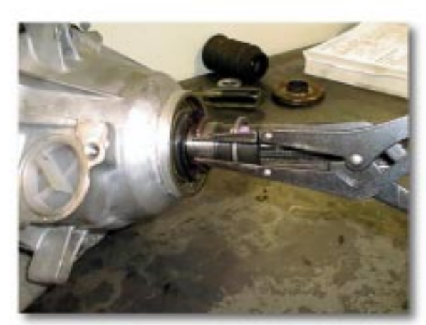
(Fig. 4) Stop Spacer & Snap Ring Removal