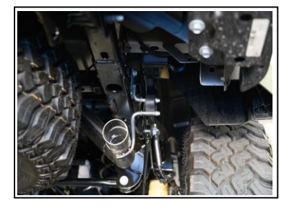
6. Install the Passenger overaxle pipe (E) using clamp (H) and hanger assembly (I). Use one of the body bolts (as shown in picture) and rubber grommet(K). Do not tighten.