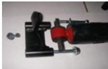
Shock adapters front and rear - Kit 001355210 only