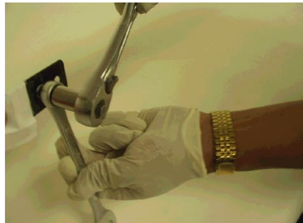
Fig. #5- Shows the tools needed to install the 1/4-20 rivet nut

-INSTALL fender flare at the 9 points (where the rivet nut is installed) using the 1/4 x 20 x 3/4" black bolts and the fender washers except the back lower rear 3 locations. Install the 1/4 x 20 x 1" bolt, washer and nut at these points. Also install the 1/4 x 20 bolts, fender washers and nylon lock nuts at the top two holes on each rear flare.