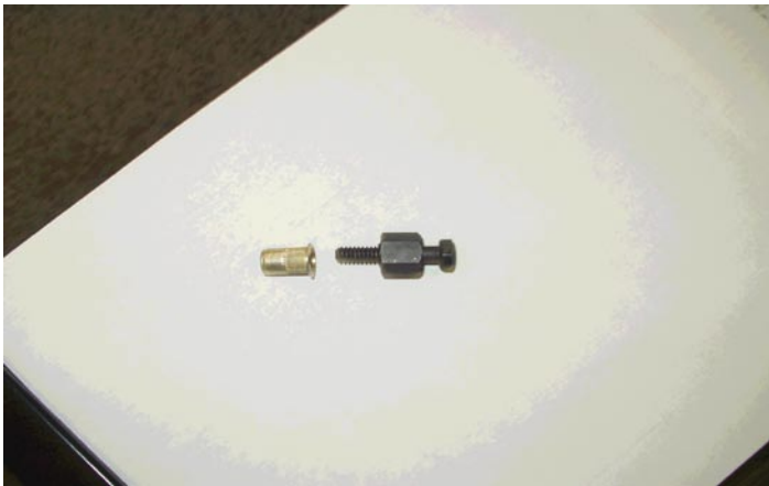
Fig. #4- Showing the rivet and the Expendable Tool

-INSTALL the rivet nut into the 9 enlarged holes using a box wrench holding the tool nut. With an 11mm socket wrench turn the bolt clockwise until you cannot turn it anymore using moderate torque. This causes the rivet nut to compress against the inside of the body hole and provides a secure point to attach the 1/4-20 x 3/4" bolts when you install the flares (again, see the instructions that come with the expendable tool). Now remove the 1/4-20 bolt from the rivet nut. Install all 9 rivet nuts (per each side). See Figures #4 & #5.