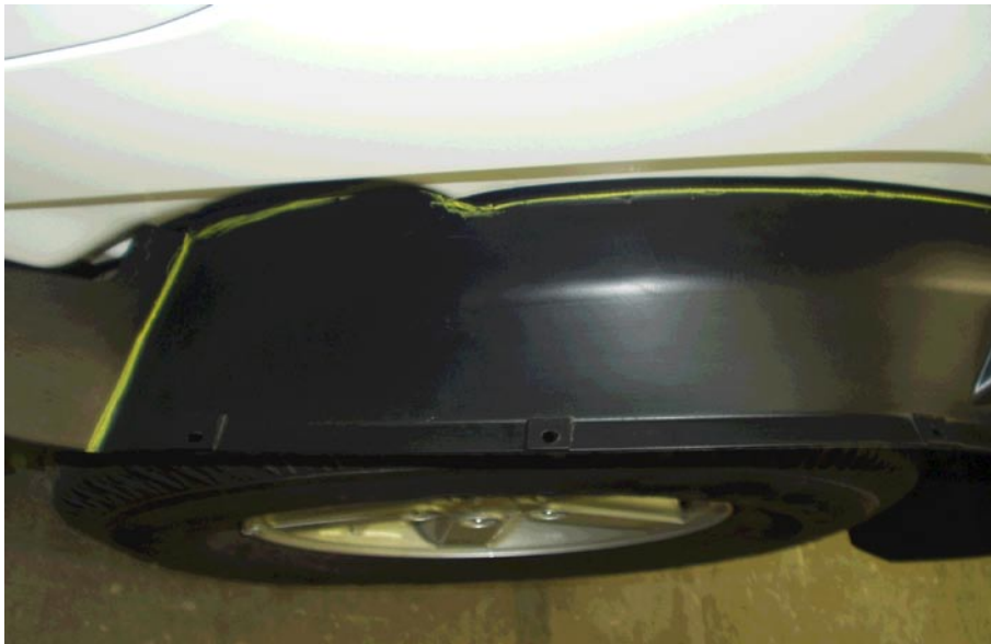
Figure #1- This photo shows the driver's rear fender liner marked for trimming. The view is of the front part of the liner.

Set the wheel liner back onto the Jeep. Using a light colored grease pencil and using the edge of the steel wheel opening as a guide mark the wheel liner from front to back (See Figure #1). Remove the liner.