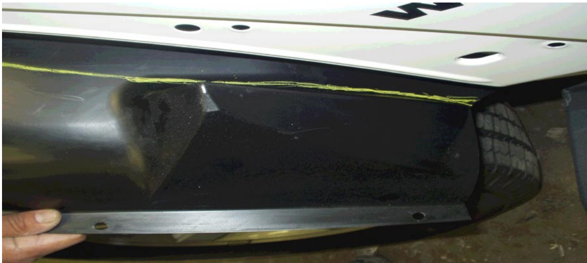
Figure #1 -This picture shows a portion of the front liner marked for trimming. The liner has been pulled out several inches to illustrate the grease pencil trim mark. This view is from the top of the liner looking toward the rearward section of the liner.

Trim the wheel liner where marked with a razor blade knife and clean up the trimmed edges with 150 grit sandpaper (See Fig. 1 & 2).