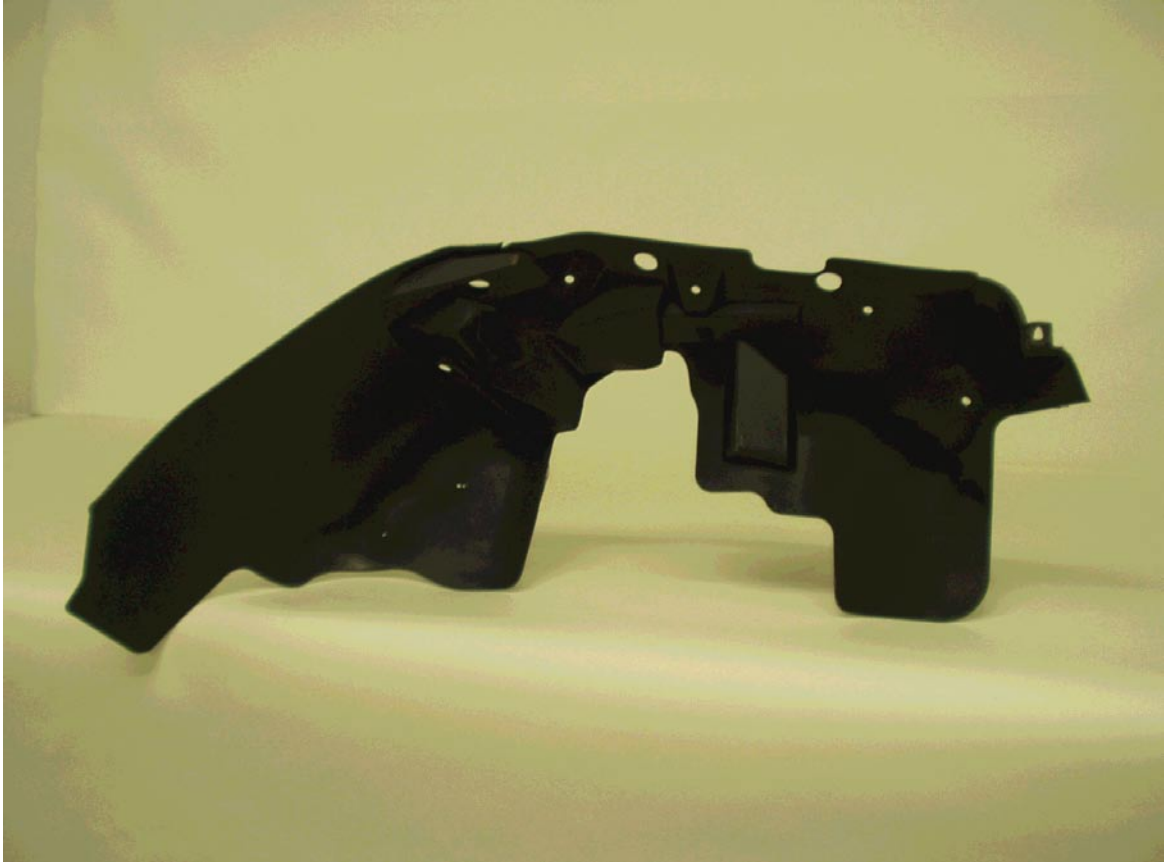
Figure #2- This picture illustrates the driver's side front liner trimmed. The photo is taken from the inside of the liner.

PHASE 2) PREPARATION OF URETHANE PART(S) FOR PAINTING (July, 05): This process is following an approved Sherwin Williams process and materials. Consult your paint supplier for equivalent materials and / or processes.