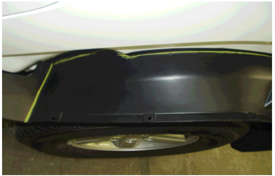
The view is of the front part of the liner.

Figure #1- This photo shows the driver's rear fender liner marked for trimming.