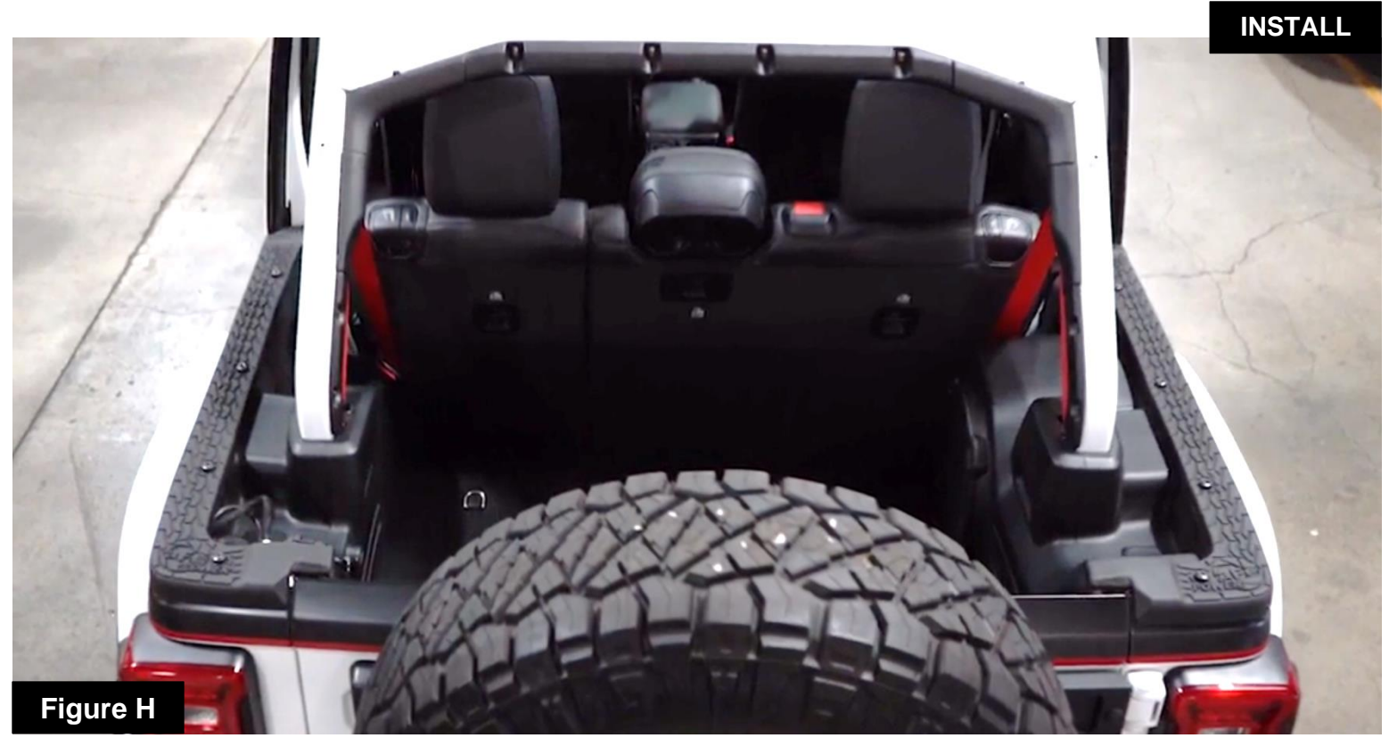
Refer to Figure H for Step 11