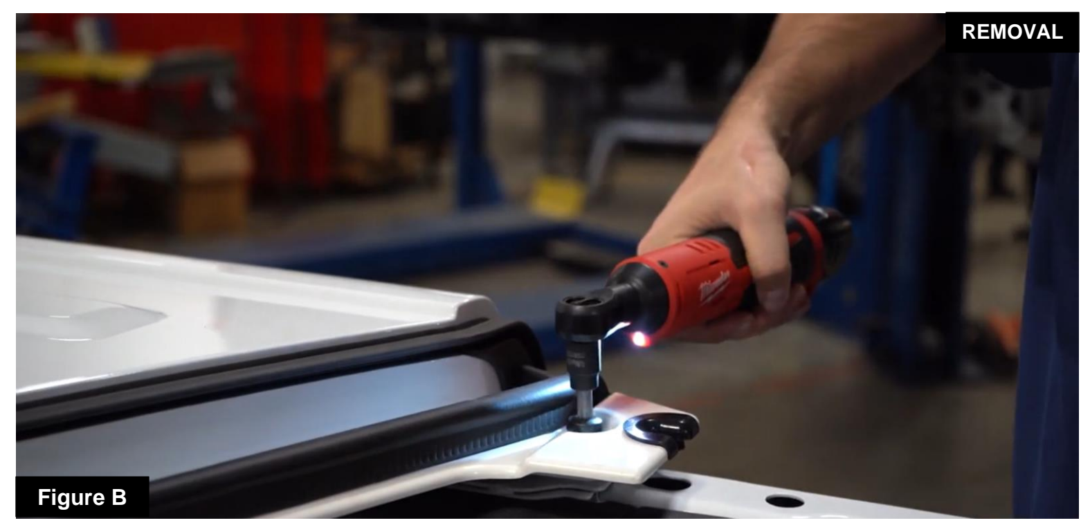
Refer to Figure B for Step 3

Step 3: Using a T-50 Torx bit and driver, remove the (2) two screws from the front of the hard top located on the roll bar rails. There is (1) one screw on each side. Save these bolts for later.