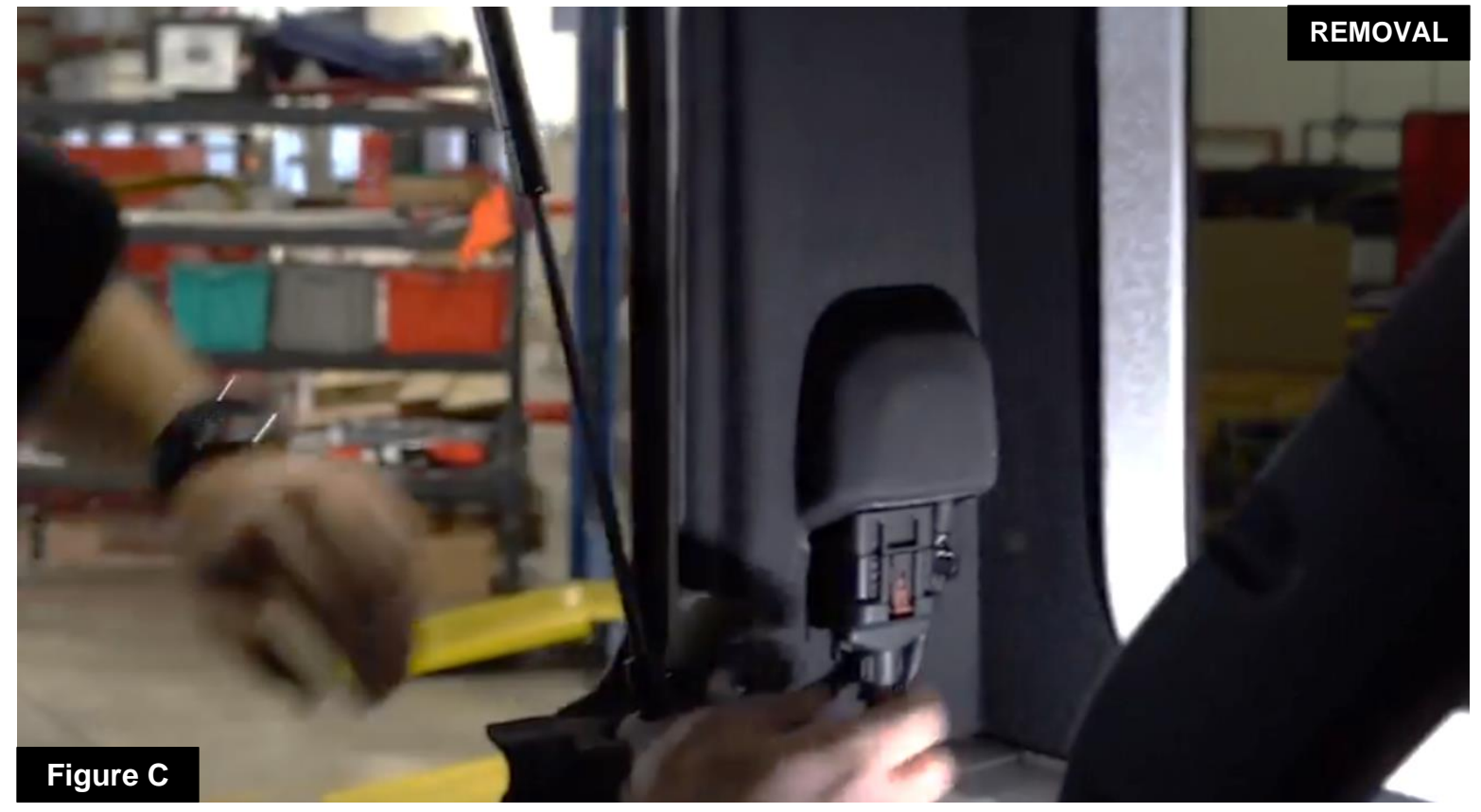
Refer to Figure C for Step 4