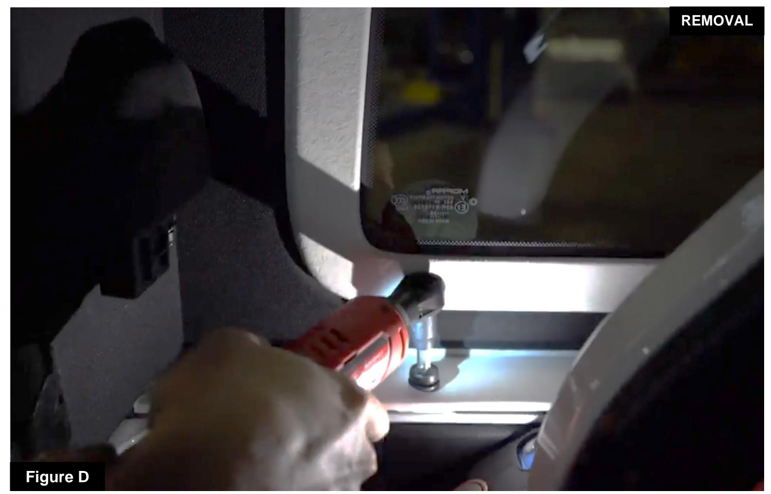
Refer to Figure D for Step 5

Step 5: From the back of the vehicle, using a T-50 Torx bit and driver, remove the (6) six bolts that secure the hard top to the tub rail of the Jeep. Save these bolts for later.