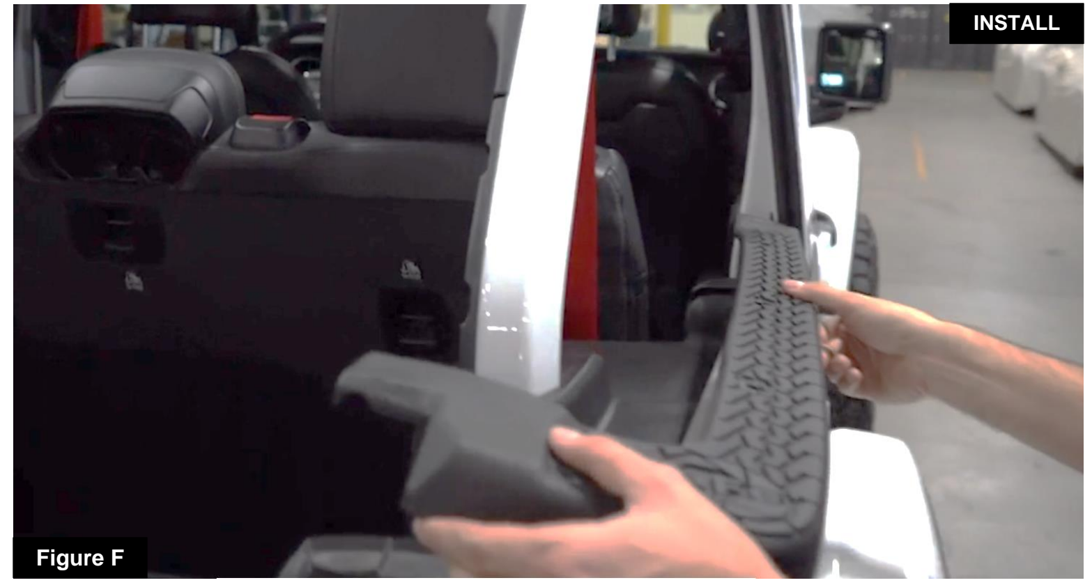
Refer to Figure F for Step 8