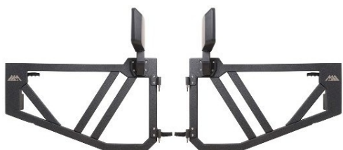
Trail doors with mirrors: 81-20900. 2018-Onward Jeep Wrangler/Gladiator