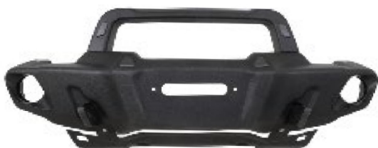
Guardian Stamped Front Bumper Mid Width: 81-20301 2007-Onward Jeep Wrangler/ 2019-Onward Jeep Gladiator