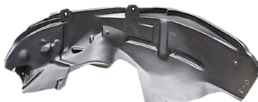
Plastic Fender liners Front: 81-21202 2018-Onward Jeep Wrangler/Gladiator