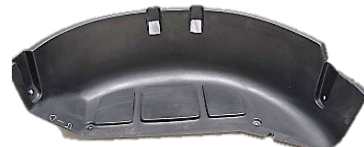
Plastic Fender Liners Rear: 81-21203 2018-Onward Jeep Wrangler/Gladiator