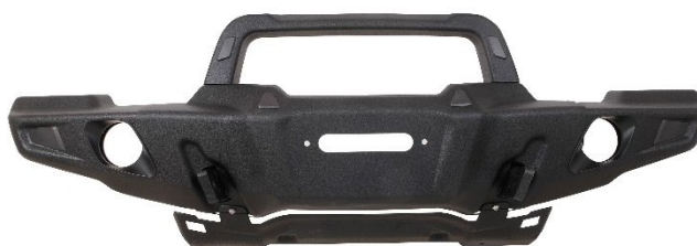
Guardian Stamped Front Bumper Full Width: 81-20302 2007-Onward Jeep Wrangler/ 2019-Onward Jeep Gladiator