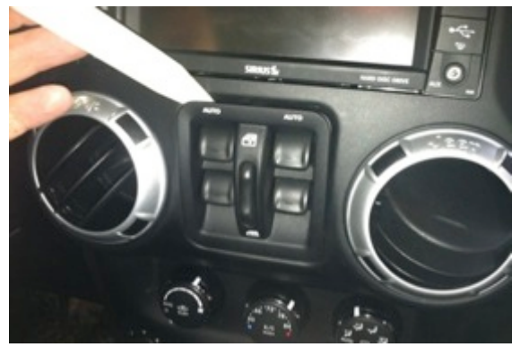
Step 21: Disconnect harness from window switches.

Step 20: Using a plastic trim removal tool, remove window switch panel.