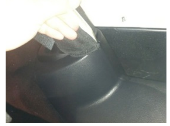
Step 15: Pull out subwoofer box slightly to gain access to run Chassis Harness along existing harness

Step 16: Pull back carpet and continue running Chassis Harness forward.