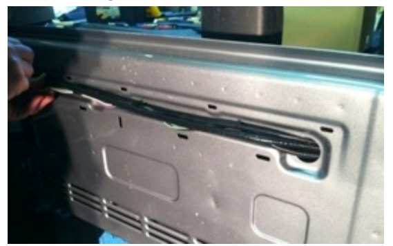
Step 11: Use supplied Wire Ties to secure Chassis Harness to fabric factory wire cover. CAUTION: Leave enough slack to allow gate to open fully.