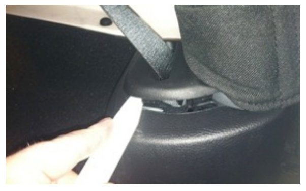
Step 14: Using a plastic trim removal tool, remove rear access panel to expose 10mm bolt, and remove bolt.

Step 13: Using a plastic trim removal tool, pry off rear seat belt closeout.