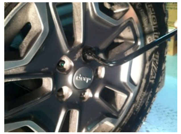
Step 2: Slide Camera on studs placing harness end inside of tire carrier. Do not run harness through the camera bracket opening .

Step 1: Loosen lug nuts to remove spare tire.