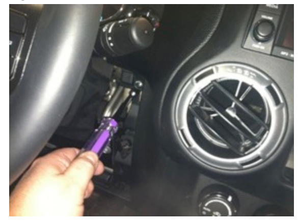
Step 25: Remove center stack/cluster surround.