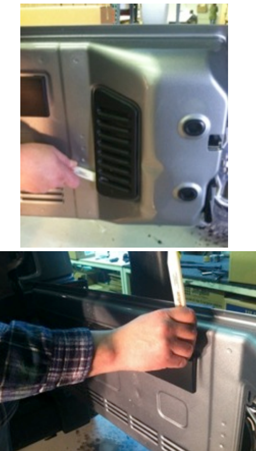
Step 8: Pull harness through the rear gate openings.

Step 7: Using a plastic trim removal tool, remove interior panels on inside of rear gate.