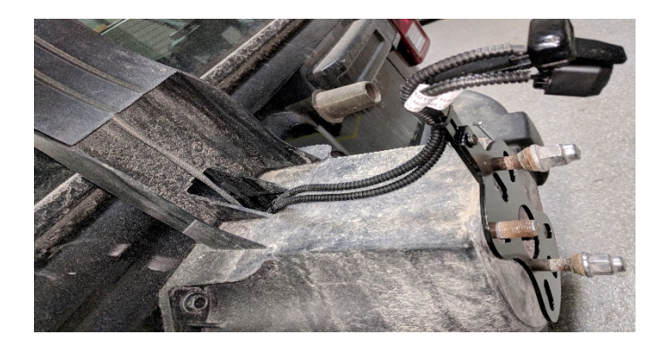
Step 1: Route cable along Camera harness and follow same route as factory 3<sup>rd</sup> brake light harness to factory opening in rear door.