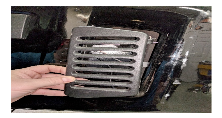
Step 3: Unplug factory brake harness and plugin our replacement harness