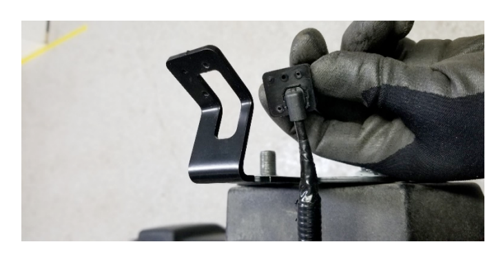
Step 2: Line the mounting holes from the new brake light bracket up with the mounting holes of the Camera and mounting bracket and reinstall the two #1 Philips screws.