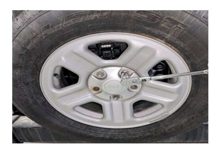
Step 1: Remove spare tire