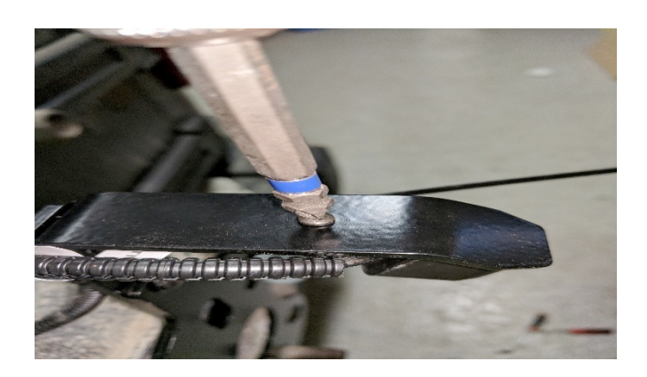
Step 2: Line the mounting hole from the new brake light bracket up with the mounting hole of the Camera and mounting bracket and reinstall the one #1 Philip screws.

Step 1: Locate and remove one #1 Philips holding Camera to bracket