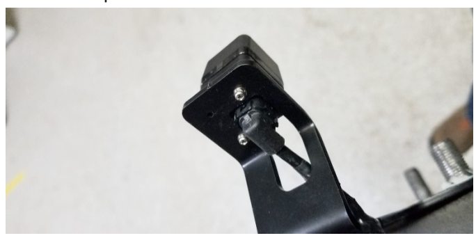
Step 1: Locate and remove the two #1 Philips screws from the back-side of Camera.