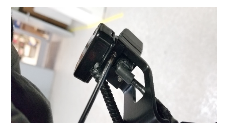
Got to wiring steps next: