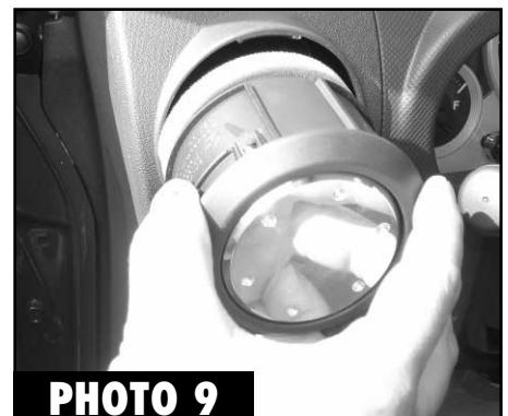
Insert the entire Vent Assembly back into the opening and twist counterclockwise into the locked position. Repeat for the other vents and you're finished.