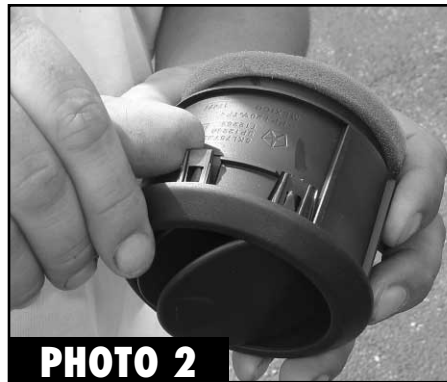
Using your finger, remove the Vent Ring by lifting the four clips.