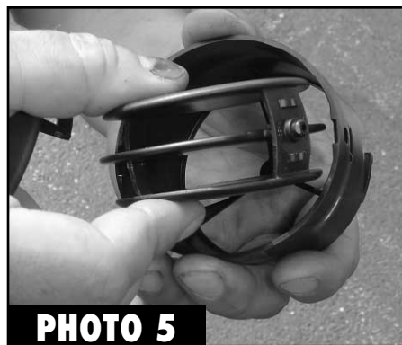
By squeezing the top and bottom of the plastic surround, you can pull out the factory Vent.