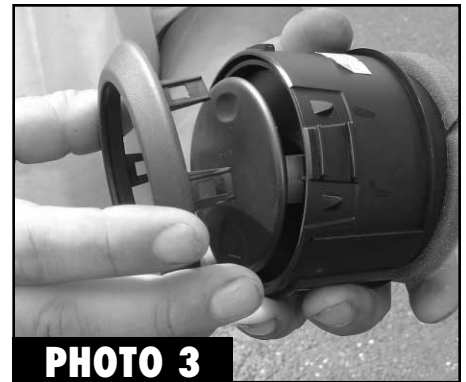
Pull the Vent Ring off.