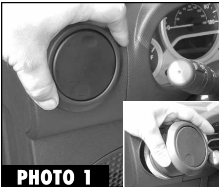
Twist the Vent Ring clockwise and pull out the entire Vent Assembly.