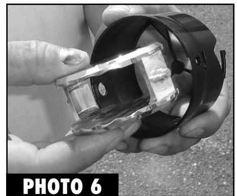
Insert your new Vent and align with the holes.