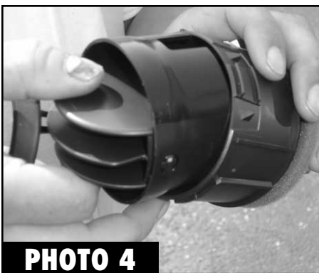
Pull the Vent out of the housing.