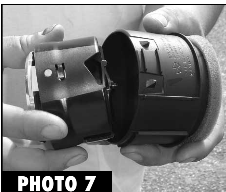
Place the Vent back into the housing.