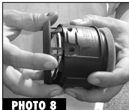
Align and clip all four tabs of the Vent Ring.