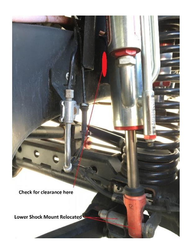
**All lift kits have different geometry and some can cause a 2.5" shock to come in contact with the frame on the passenger side at full extension. It is recommended to use an adjustable track bar to compensate, or to use lower shock relocation brackets to move the lower mount closer to the wheel.