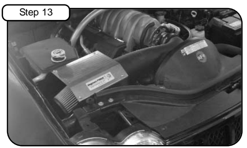
Your installation is now complete. Please check all bolts and clamps perodically. Re-tighten if necessary. Thank you for choosing aFe!

Install cover to housing with button head screws provided and tighten using 5/32" allen key.