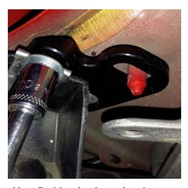
Next, Position the charcoal canister into position at the lower bolts, and rotate to line up with the new relocation bracket and install the supplied 10mm bolt and washer.

American Trail Products, LLC 817 East Lambert Road La Habra, CA 90631 Phone (877) 360-5337