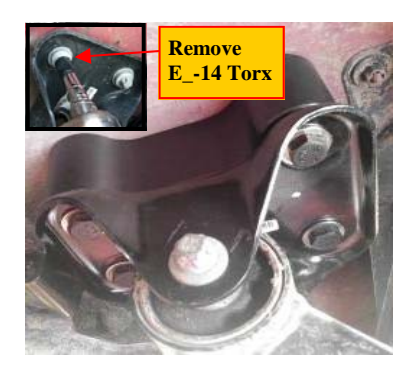
Remove the bolts holding the bracket with the E-14 Socket. Now install the drop spacer with supplied hardware and torque to 75 ft lbs. Repeat on other side.