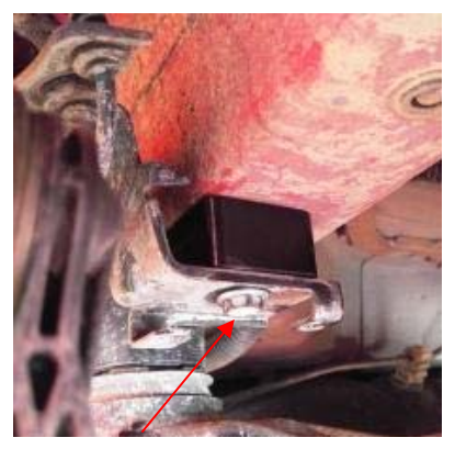
Remove the two bolts that attach the ABS/Brake line brackets. Next, install the spacers on both sides and tighten all hardware.