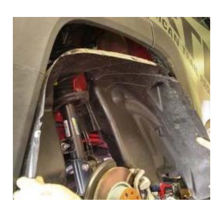
Remove the inner fender liners with a Phillips screw driver and 10mm socket. You have 5 Phillips head screws and 4 10mm plastic nuts that hold the liner in place. Now you should be able to carefully remove the liner from the vehicle.