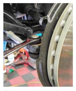
Disconnect the tie rod from the steering knuckle. You will need a 17mm socket to remove the nut, and a hammer to strike the knuckle and free the tie rod.