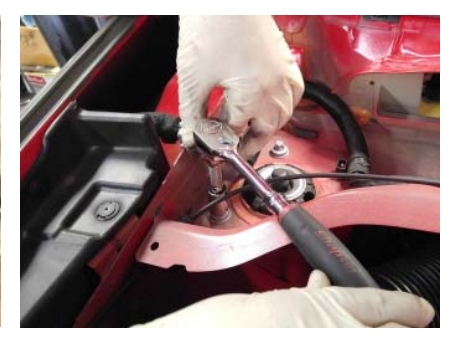
Finally, remove the 3 upper strut bolts with the E-14 reverse Torx socket and remove strut from vehicle.