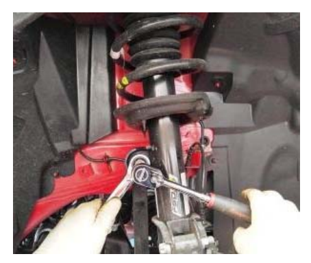
Starting on the drivers side, remove the sway bar link. You will need an 18mm wrench for the nut and T-40 Torx bit to hold the shaft during removal.