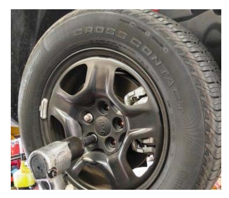
First, make sure parking brake is engaged. Lift the front of your vehicle and support with jack stands. Remove the front wheels with a 17mm socket.