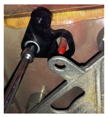
Attach relocation bracket into the upper hole as shown using the factory hardware using a 10mm socket.