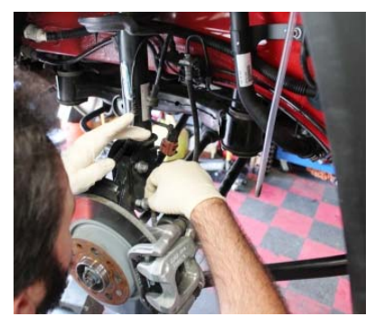
Remove the sway bar end link from the strut and push away from the strut. Now, remove the 2 bolts holding the strut to the knuckle and remove the strut from the knuckle.