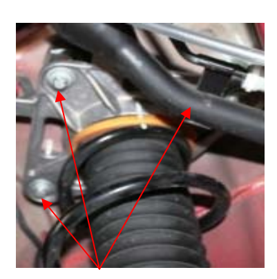
Next remove the 3 bolts that attach the strut to the body. You can now remove the strut from the vehicle.