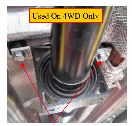
Remove carrier bearing bolts using an E-14 reverse Torx socket. Next install the carrier bearing spacers and longer supplied hardware. Once you have both bolts installed, tighten.