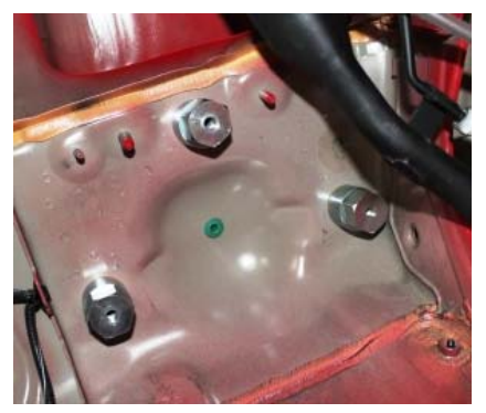
Install on the supplied strut spacers (3 per side) and tighten into the body and torque to 35 ft lbs.