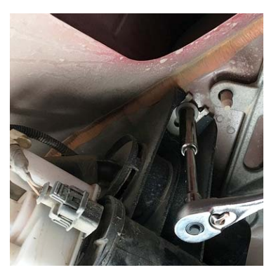
Next Remove the charcoal canister 3 bolts using a 10mm socket. You will need to swing the canister to the side to get the rear strut installed. Being careful not to damage the tubes or wiring connected to the canister.