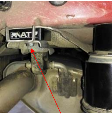
Remove the two bolts that attach the exhaust hangers. Now, install the spacers on both sides (just under the heat shield) and tighten all hardware.