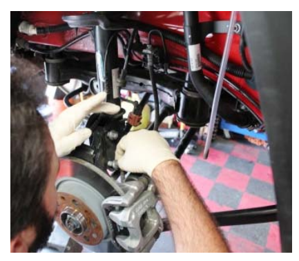
Now, Secure the strut assembly to the steering knuckle using the factory bolts and then, using an E-18 reverse Torx socket and a 16mm socket, tighten them to 90 ft. lbs. Now, attach the sway bar end link, then attach the brake line, ABS line and E-brake wires using all factory clips. Repeat on other side. Now check all hardware to ensure a proper install.