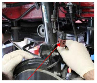
Remove brake line, ABS line and Ebrake wire from strut with needle nose pliers. Next remove the E-brake plug from the caliper being careful not to damage.