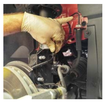
First remove the clip that holds the brake line to the strut with needle nose pliers. Now remove the ABS line from its attachment points on the strut body.