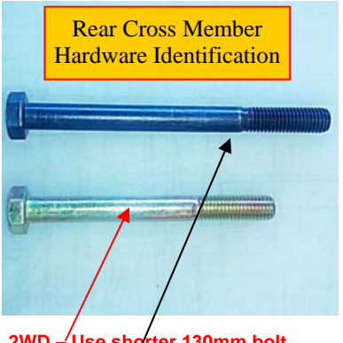
2WD – Use shorter 130mm bolt 4WD – Use longer 160mm bolt

American Trail Products, LLC 817 East Lambert Road La Habra, CA 90631 Phone (877) 360-5337