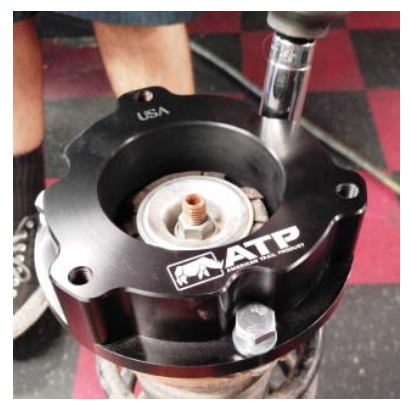
Place your new lift spacer on top of the strut and install the provided M10 bolts using red Loctite and torque to 35 ft lbs.