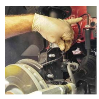
Reattach the brake and ABS lines to the strut using all of the factory retaining clips.

Note: At full droop axle may be touching the strut, this is normal and during install.