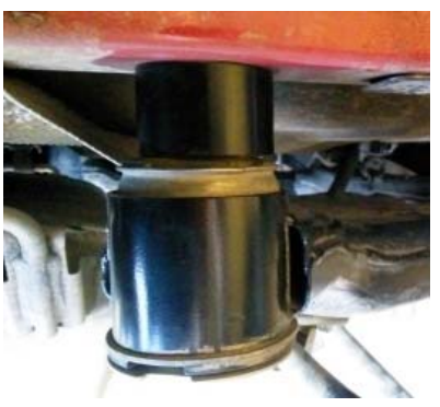
Support the rear differential with a floor jack while loosening the cross member bolts with the E-20 reverse Torx. Next remove bolts on one side, install the spacers with supplied hardware and repeat on the other side of cross member. Tighten hardware to 120 ft lbs.