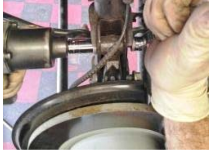
Next, remove the bolts that attach the strut to the knuckle using a 16mm wrench & E-18 Torx and pull the strut out of the steering knuckle. Caution, support steering knuckle and CV axle when separated to avoid popping the axles out and damaging the CV joint.