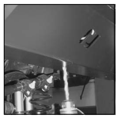
7) Now go back and drill the holes. Drill pilot holes first with a 3/16" bit, and then follow that up with a 3/8" bit.