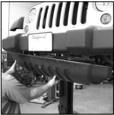
1) Remove all plastic attaching screws from stock plastic valance panel, then remove the panel from the vehicle.