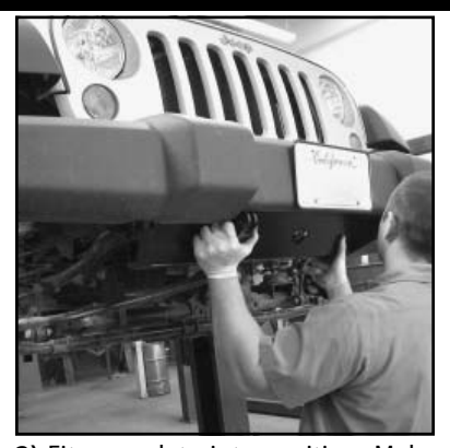
2) Fit new plate into position. Make sure the ends of the new plate wedge between the ends of the stock plastic bumper cover and the metal of the frame crossmember.