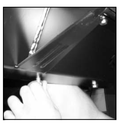
9) Start several of the bottom bolts into their holes with washers and nuts, and then remove the C-clamp or Vise-Grips that you had the plate clamped to the crossmember with.