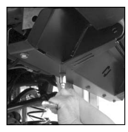
10) After all of the lower bolts are in their holes, go back and tighten all of the bolts with a 9/16" wrench on top and socket on the bottom.