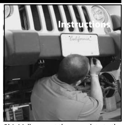
3) Initially mount the new plate to the bottom of the bumper by installing 4 of the 3/8"-24 x 1" bolts, washers top and bottom, and nylock nuts in the 4 pre-existing upper holes. Snug these bolts, but do not tighten.