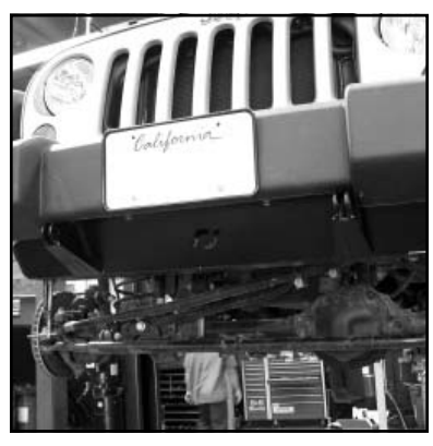
4) Before proceeding any further, center the new plate side to side on the vehicle using the bumper guards and the tow bar mounts on the plate as reference. Tighten the 4 top bolts.