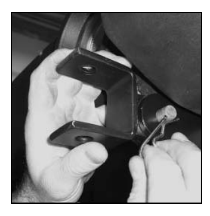
11) Attatch tow bar ends by inserting them into the bracket on the plate and affixing them in place with the clevis pins and hairpins. Tow bar ends must then be bolted to the tow bar of your choice.