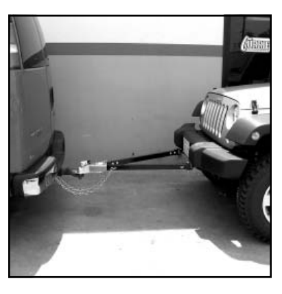
12) For optimum performance your tow vehicle's hitch should allow for the tow bar to ride as level as possible. Always use safety chains (included with the CE-9033F tow bar). This system will work with universal adjustable tow bars from Friedl, Draw-Tite, Valley, or Blue Ox.