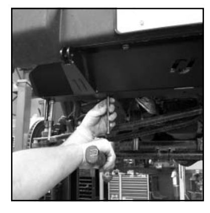
6) Using the plate as a template, and a 3/8" transfer punch, punch the 2 undrilled upper holes and all of the bottom holes.