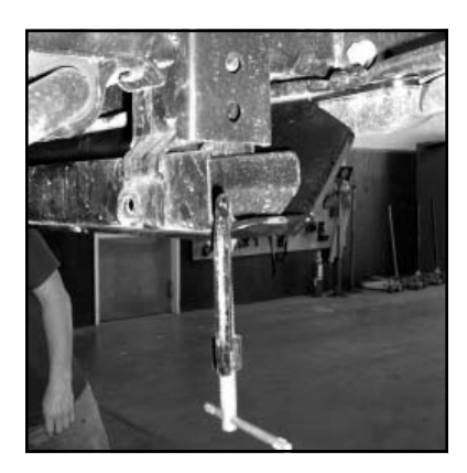
5) Next, with C-clamps or Vise-Grips, clamp the back of the plate up snuggly to the bottom of the crossmember.