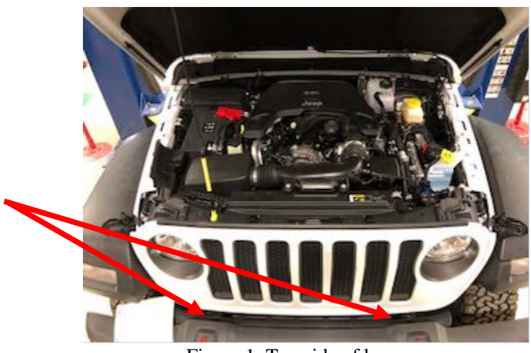
Figure 1: Top side of bumper

A ) Remove (2) dart clips from back side of plastic skid plate.