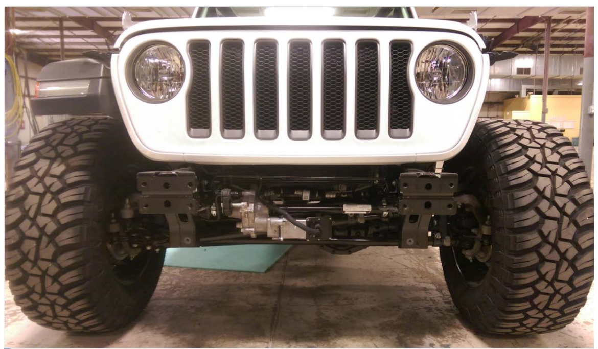
Figure 3: Bumper removed

□ H) Using Torx bits, removed the shroud and tow hooks from the factory bumper. The tow hooks will be reused in the Vengeance bumper.