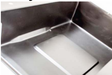
Reinforced Fiberglass Bed