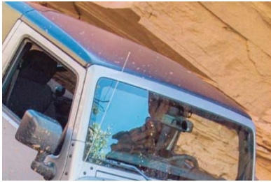
Removable Sun Top