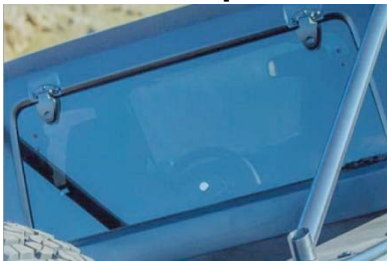
Rear Lift Window