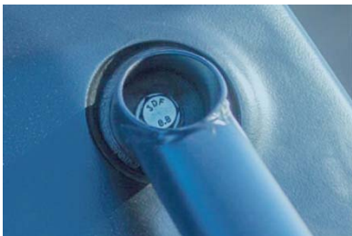
Bolt On Roll Bars