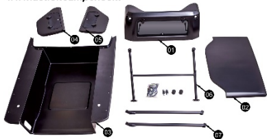
ActionTruck JKAT001 by Thaler Design www.actioncamper.com

⚡ If your Jeep was involved in an accident or any jumping, this install may be a very time consuming job to do.