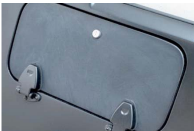
Side Cargo Doors