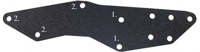
Passenger side bracket – bolt location guide

Passenger Side: Utilizing the hole locations in the frame rails, mount the supplied bracket with the hardware noted below.