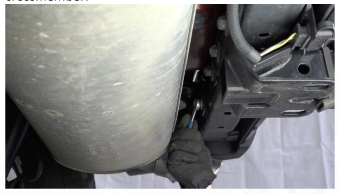
Remove the 2 16mm bolts between the body and bumper.