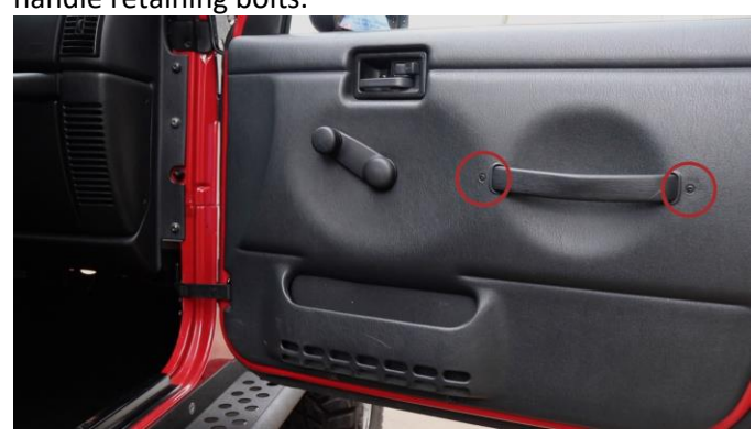
With a T15 Torx bit, remove these two bolts and washers.

Open your vehicle's door and locate the inner door handle retaining bolts.