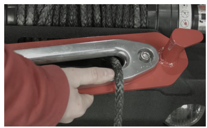
Holding the two parts together, place them up to your bumper and into place using the two included bolts lead by a flat washer.

Fits Standard Fairleads Winch Line "Fishhook"