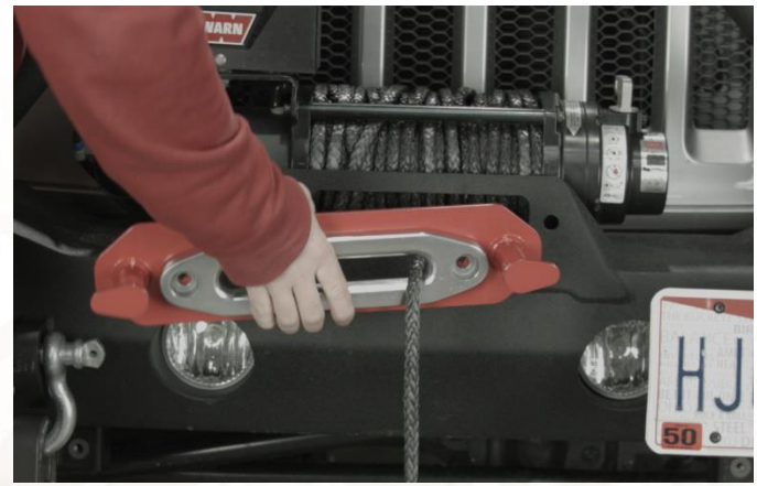
Slide your synthetic rope through the Fishhook's cable slot followed by your winch's fairlead.