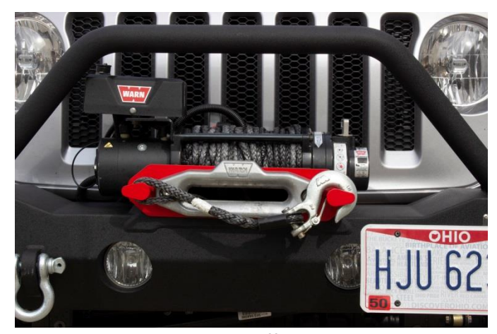
Enjoy your Fishbone Offroad Winch Line "Fishhook"!

Wrap the excess synthetic rope around the rope support and resecure your winch hook.