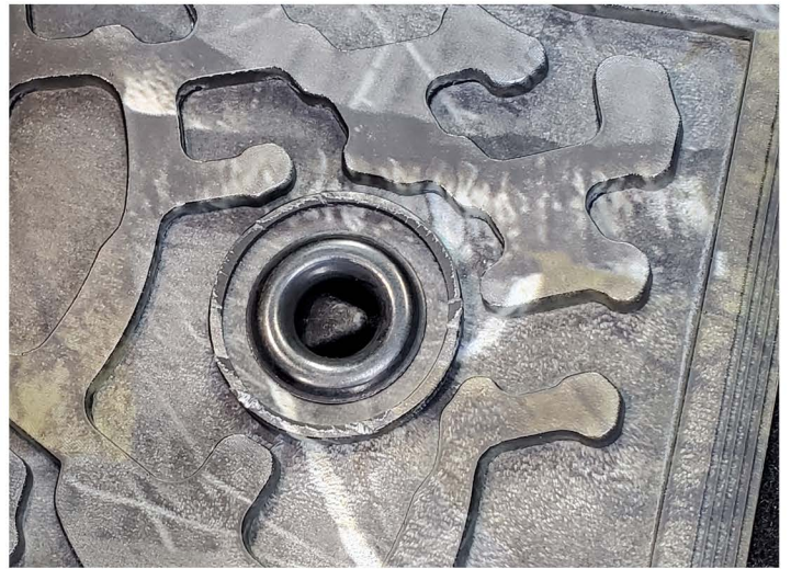
Slide the grommet(s) of your FLEXTREAD™ mat onto the hook(s)