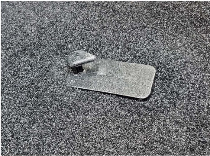
Remove old mats to expose your vehicle's safety hook(s)

See the corresponding images for the proper fastening of your factory floorpan fit mats.