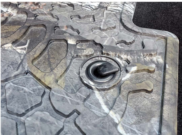
Slide the mat forward slightly making sure that each hook is fully engaged through the grommet