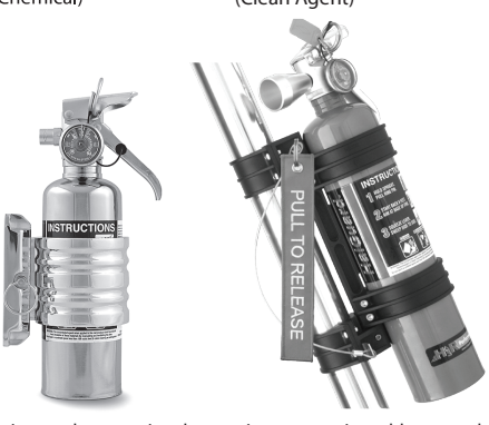
Above image shows optional mounting accessories sold separately