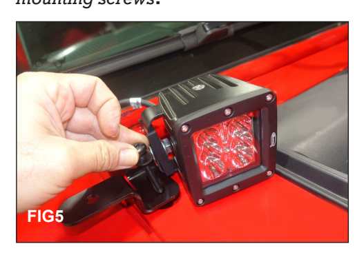
(FIG5) Using a 4mm hex bit driver loosely install the M6 X 1 X 50 Cap Screw and M6 washer.