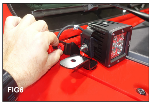
(FIG6) Using a T50 Torx bit socket re-install the windshield hinge screw. Tighten all hardware to 6ft-lbs.