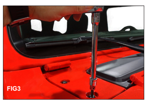
(FIG3) Using a T40 Torx bit socket remove the 4 Cowl mounting screws and carefully remove the Cowl. (FIG4) Run the wiring for the cube lights then re-install the Cowl. Using a T40 Torx bit socket loosely install 3 of the Cowl mounting screws.