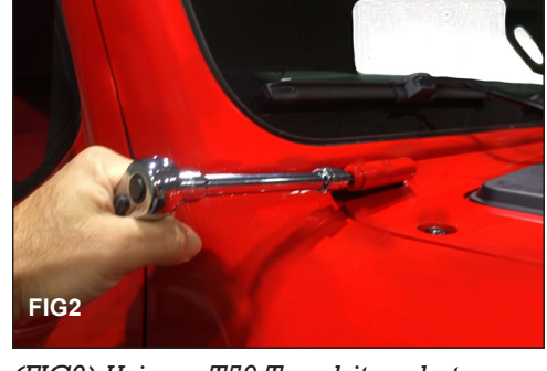
(FIG2) Using a T50 Torx bit socket remove the windshield hinge screw.