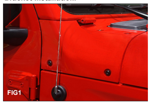
Put on safety glasses. (FIG 1) Using a 3/8" box wrench unscrew the antenna.