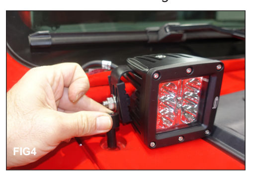
Insert the 19 x 34.2mm step spacer into the Cowl mount hole closest to the windshield hinge.