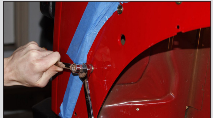
IMAGE MAY NOT MATCH THIS PART INSTALLATION. IT IS FOR ILLUSTRATION OF THE USE OF THE TOOL ONLY.

B. Insert the knurled end of the rivet-nut into the hole, pressing its flange firmly against the Jeep's sheet metal. Use an end wrench to hold the coupler nut stationary while turning the head of the bolt clockwise with a ratchet and socket. As the ratchet is turned, the bolt will draw the far end of the rivet-nut toward the inside of the sheet metal, gripping it with the knurled outside edge of the nut-sert as it deforms.