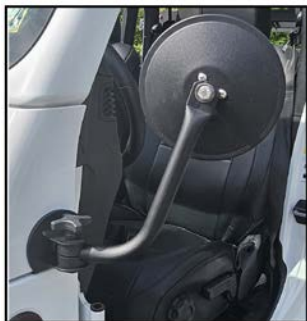
13111-0440 JL/JT Round

Installation Manual: For Jeep Wranglers JL / JT / 4xe #13111-0440 / 0510 (Round Head) #13111-0441 / 0511(Rectangle Head)