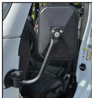
13111-0441 JL/JT Rectangle