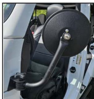
13111-0510 4xe Round