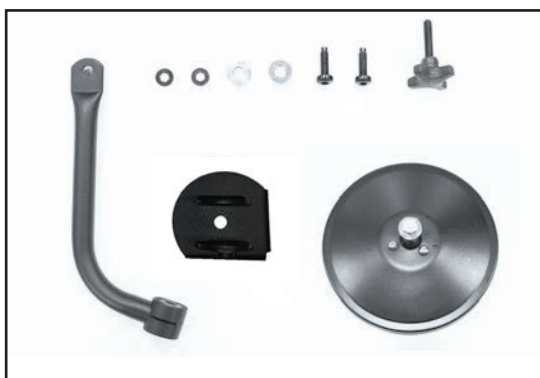
Standard Base JL/JT Round Head