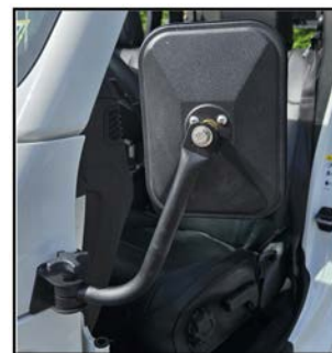
13111-0511 4xe Rectangle