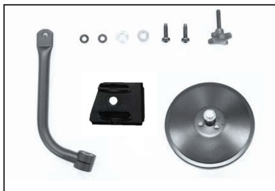
4xe Base JL/JT Round Head