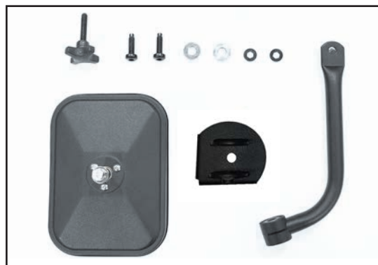
Standard Base JL/JT Rectangle Head