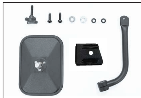
4xe Base JL/JT Rectangle Head