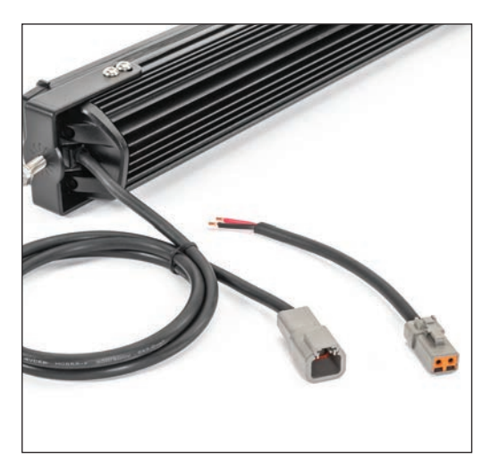
to connect to any other harness. Your routing will depend on your specific brackets and wiring harness location. If you are using a Quadratec wiring harness and mounting brackets please refer to the instructions that came with those components.

Connect the Deutsch connector to the corresponding connector on your Quadratec wiring harness (sold separately) or the use the supplied pigtail