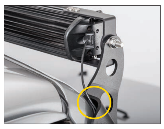
The Clearance light accessory wire can be routed behind or next to your A pillar bracket.