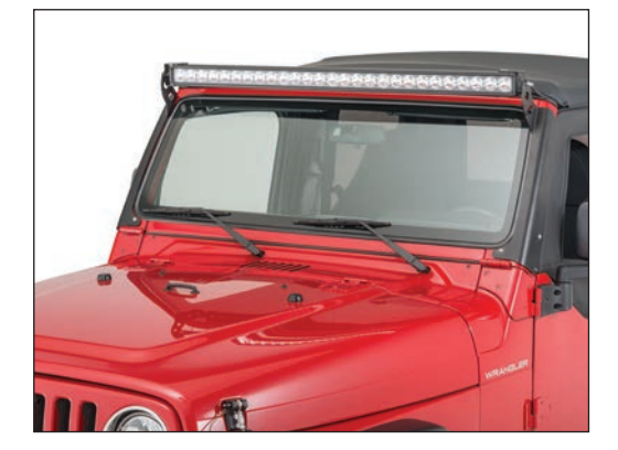
Normal Daytime Driving Mode (OK on-road)