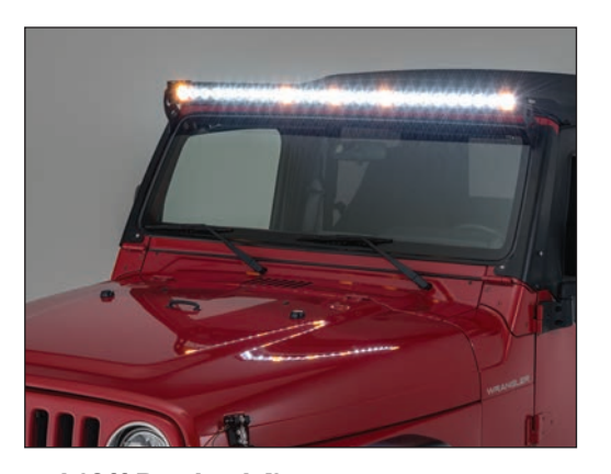
Clearance Lights with Off-Road Lights illuminated (Off Road only!)