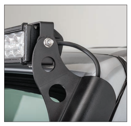
The main power wire can be routed behind or next to your A pillar mounting brackets.

Connect the Deutsch connector to the corresponding connector on your Quadratec wiring harness (sold separately) or the use the supplied pigtail