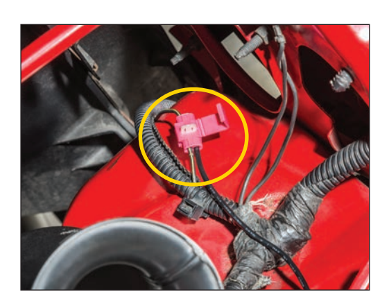
Install the supplied wire tap over the black wire with yellow tracer stripe. Install the cut end of the accessory wire into the other slot in the wire tap as shown. Using your pliers, gently