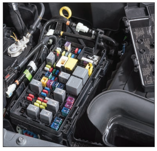
On JK vehicles: The fuse box is located under the hood on the right hand side of the engine compartment. Locate fuse panel lid and remove it.

WHEN ROUTING ELECTRICAL WIRES, ALWAYS AVOID PINCHING WIRES. ALWAYS AVOID HOT OR MOVING COMPONENTS. ALWAYS SECURE WIRES WITH CABLE TIES.