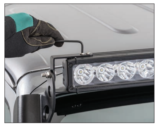
Snug the button headed screws on the top and bottom of both ends of the lightbar with a 4mm hex wrench.