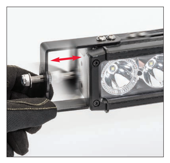
Put on Safety Glasses. Loosen the button head hex screws (4) on the top and bottom on each end of the light bar brackets with a 4mm hex key. This will allow the brackets to slide in and out in order to fit multiple width light bar mounts.