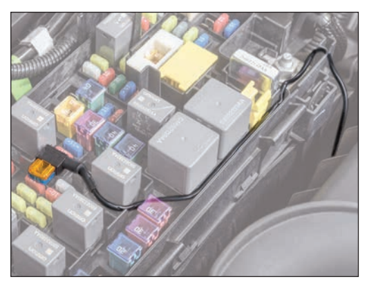
Install the fuse holder back into the M18 fuse location in your fuse box. Route the wire as show and replace the fuse lid. Be careful not to pinch the wire.