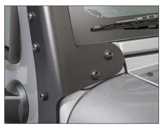
Safely route the wire to the fuse box on your vehicle. The clearance lights will be tied into your parking light fuse so that they will be on whenever your parking lights or headlights are turned on.