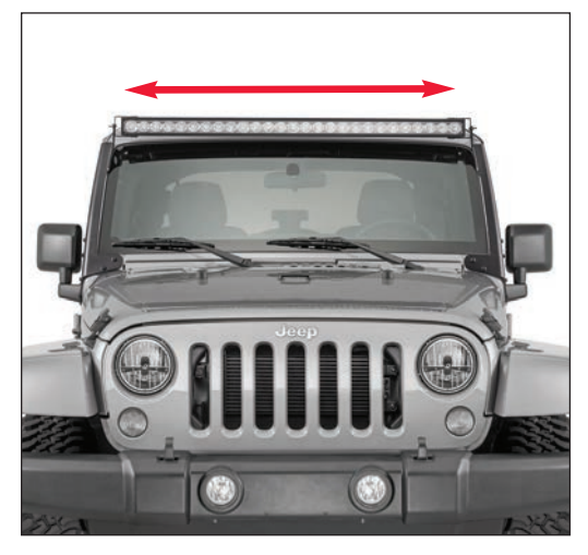
Position the light bar on your mounting brackets and center it left to right on your the vehicle.