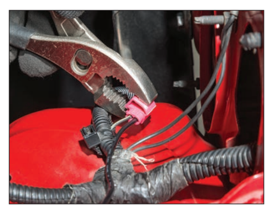
close and latch the cover wing of the wire tap to complete the circuit. For best weather resistance, wrap the wire tap with black electrical tape. (not shown)