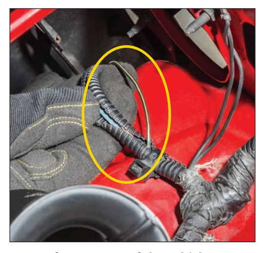
senger front corner of the vehicle. Locate the wire loom behind headlight bucket and extract the black wire with yellow tracer stripe.