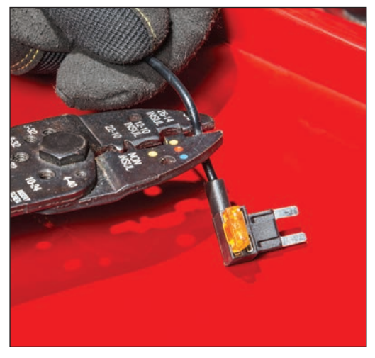
On TJ vehicles: Snip off the fuse tap on the end of the accessory wire on your new lightbar. Route the wire under the hood along the fender wall to the pas-

WHEN ROUTING ELECTRICAL WIRES, ALWAYS AVOID PINCHING WIRES. ALWAYS AVOID HOT OR MOVING COMPONENTS. ALWAYS SECURE WIRES WITH CABLE TIES.