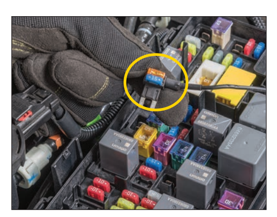
Remove the 15 amp fuse and install it in the lower slot of the light bar harness fuse holder. The upper slot should have a 5 amp fuse pre-installed in it.