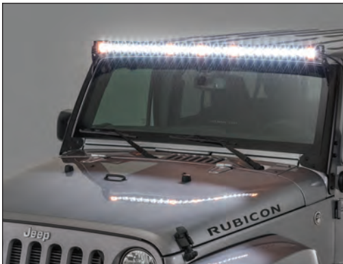
Clearance Lights with Off-Road Lights illuminated (Off Road only!)