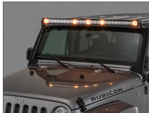
Clearance Lights (OK on-road)