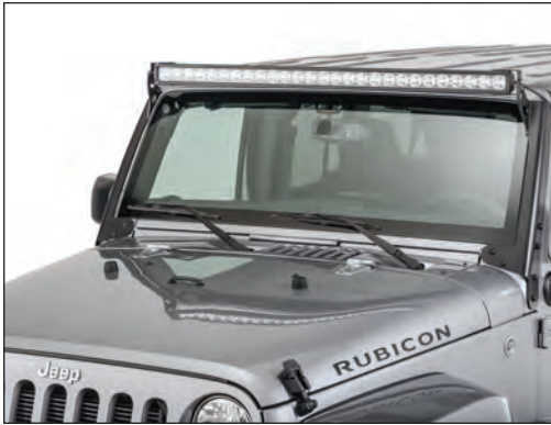
Normal Daytime Driving Mode (OK on-road)