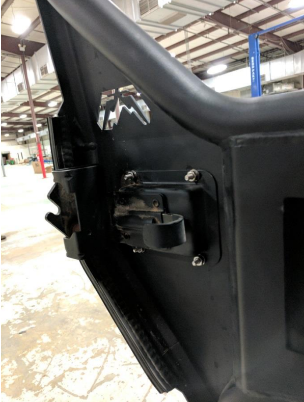
Figure 1: front door latch orientation