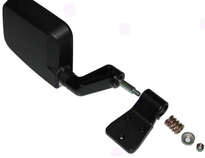
Step 4: Mount the mirror into the new relocation bracket using the cup washer and nut. Position the mirror and tighten the nut.