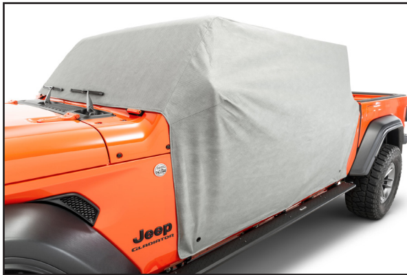
Keeps the heat out!