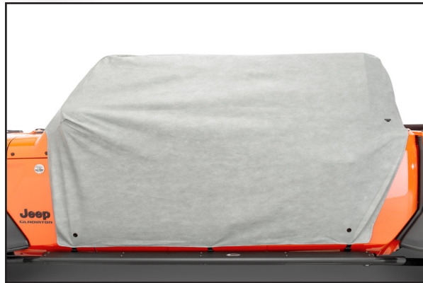
Covers the door Area