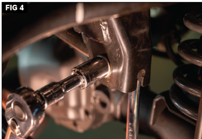
Locate the bolt holding the original trackbar to the frame. (Fig. 3) Remove using a 21mm socket with extension and rachet on one side and 21mm wrench on the other. (Fig. 4)