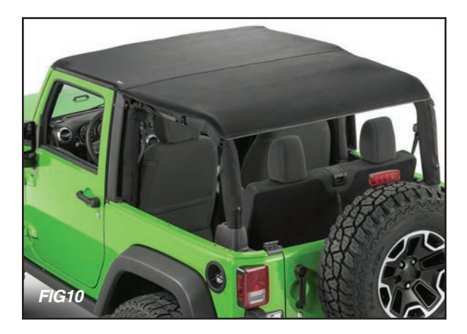
With Factory Style Door Surrounds

This product is designed to be used with Factory Style Door Surrounds. If you do not have Factory Door surrounds the Bimini top will fall inside the vehicle over the door allowing water and wind to enter the cabin. We strongly suggest the use of door surrounds when installing this product: