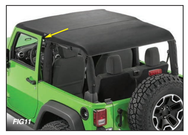
Without Factory Style Door Surrounds

The Bimini Plus Fabric lays on top of the door surround.