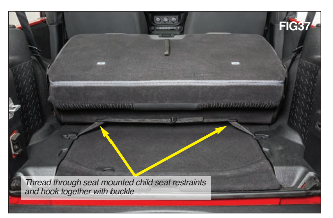
Step 3: Close the Trunk Lid and secure it.

Thread the seat strap through the child seat restraints mounted on he rear seat and secure with the attached Buckle.