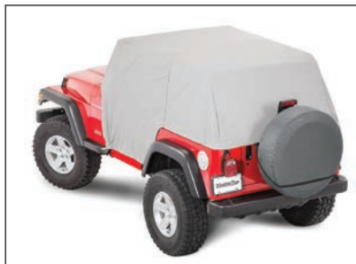
for 92-95 YJ & 97-06 TJ Wrangler