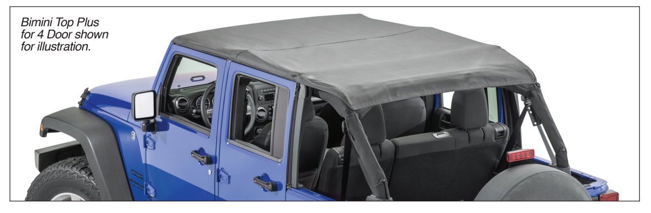
Parts List: Fabric Bimini Top or Bimini Top Plus, Qty 1

Bimini Top, Bimini Top Plus for 2007-2017 Jeep® Wrangler Vehicles Items #14100335, #14300335 and #14300435