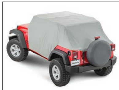
for 07-18 JK Wrangler 4-Door