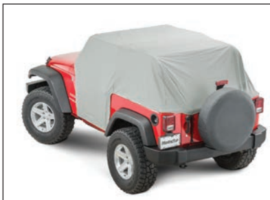
for 07-18 JK Wrangler 2-Door