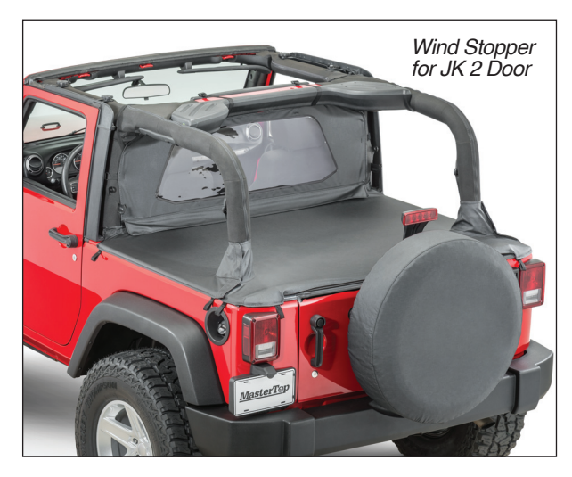
Parts List: Wind Stopper - QTY 1