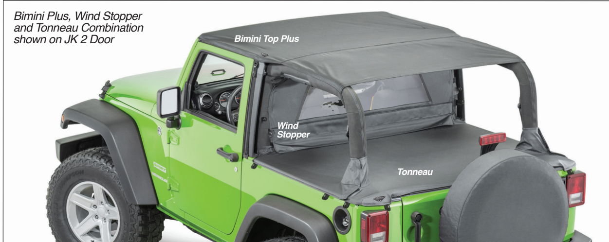
Bimini Plus, Wind Stopper and Tonneau Combination shown on JK 2 Door