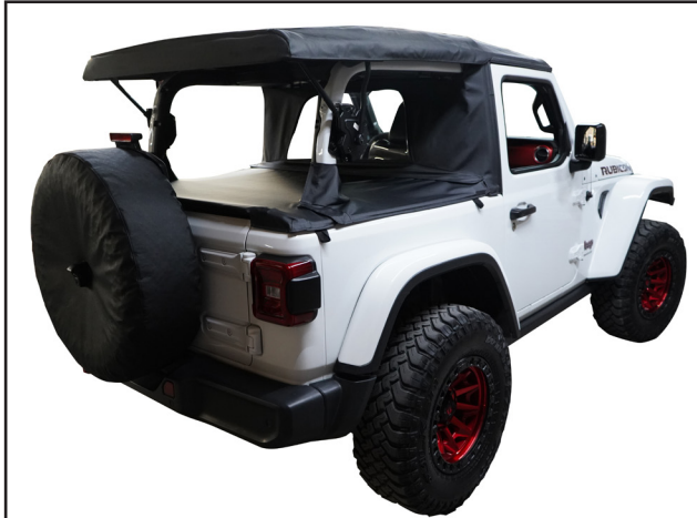
Ultimate Combo shown with the Factory Soft Top